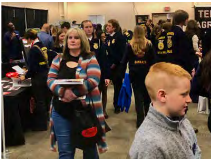
Oregon State FFA Convention.