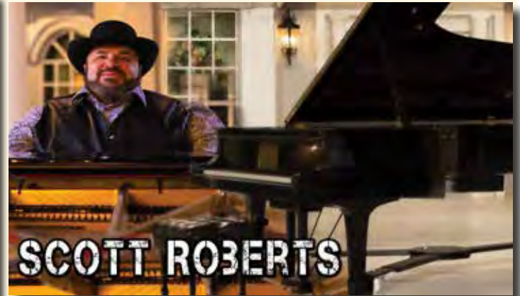
Thursday Evening Concert