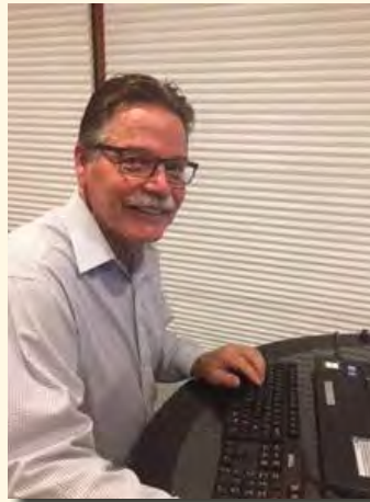
Pastor, Martintown Community Church, FCFI Chaplain