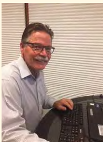
Pastor, Assistant to the FCFI Executive Director