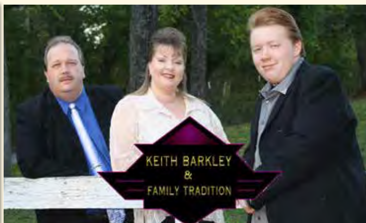
Saturday Evening Concert