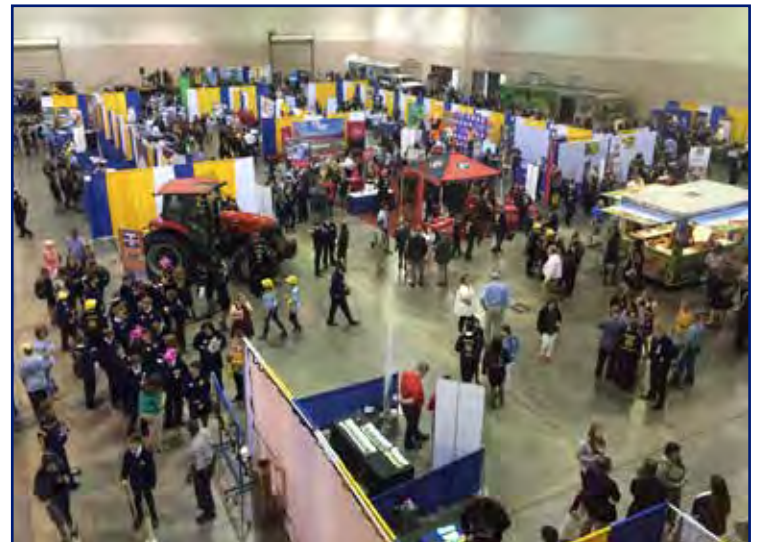
View of the 2019 Georgia State FFA Convention Career Show.

The Georgia State FFA Career Show featured a wide variety of career opportunities. Trade schools, Technical colleges, Universities including Louisiana State University, Tennessee, and the University of Georgia. Students learned about the Fellowship of Christian Farmers organization that involves high school students in disaster relief projects and collecting used shoes for shipment to countries where shoes are needed. Gospel presentations are made in the FCFI booth. Many students desire to get extra “free stuff” so they can share the gospel with their friends.