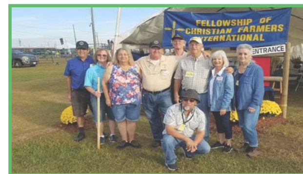
Committed volunteers came from IN, WS, NY, FL and GA to help staff at the FCFI tent at the Sunbelt Ag Expo, Moultrie, GA., Oct 19-21. Over 4,500 stopped by to hear the message. Two hundred prayed to receive Christ.