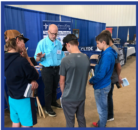
A lot of students from East Wyoming College and local high school students visited our booth in Torrington, Wyoming.