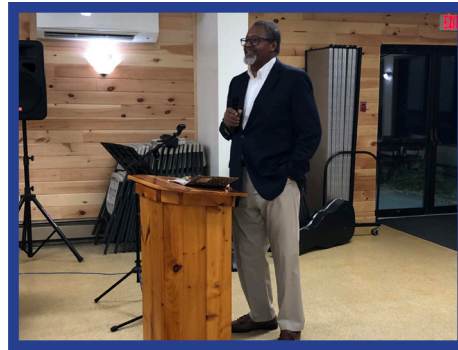
Our keynote speaker shared his life experiences and how he came to the Lord. He challenged men to be involved in helping younger men and said one of the things destroying our country is the absence of men in families. "Faith and Family can coexist."