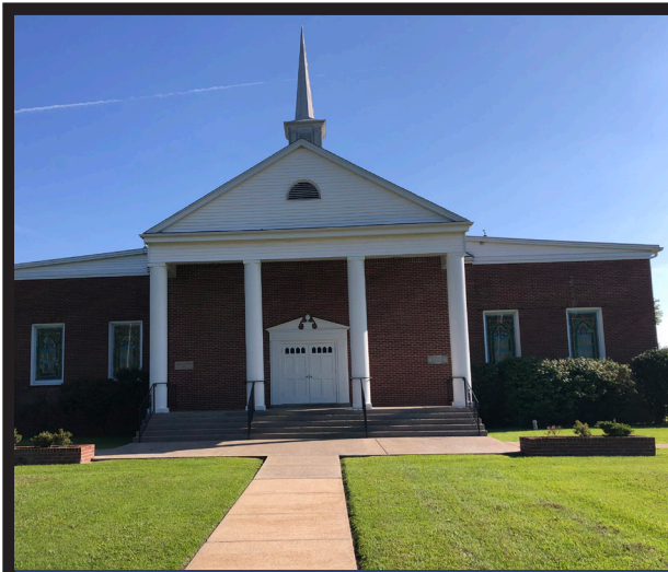
KY Mission Trip