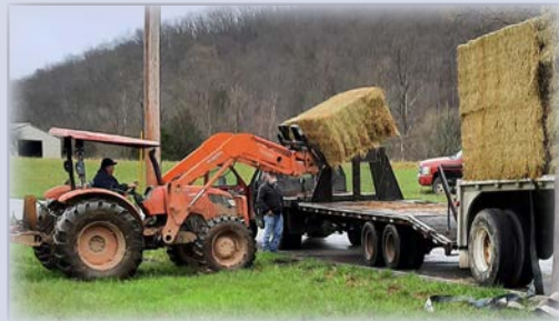
↑ Unloading 1,500 lb. bales of hay. Farmers commented that FCFI was one of the few organizations that actually stepped up to help in their time of need