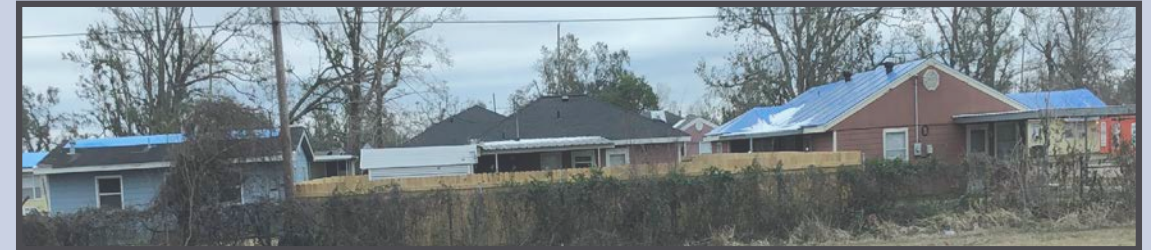
Lots of roofs covered with blue tarps.

Special thanks to Ralph Shallenberger, from the main office for providing hearty meals to keep us going.