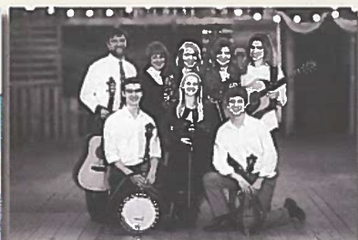
Saturday Evening Concert