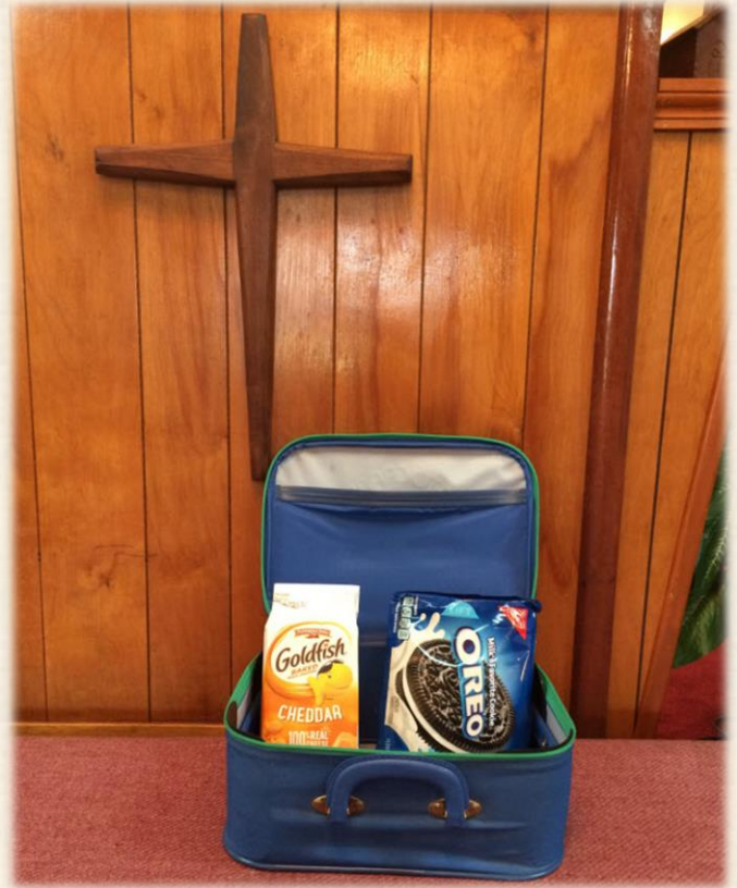
The suitcase has returned! We are taking donations to help cover the cost of feeding the kids at church camp for lunch.