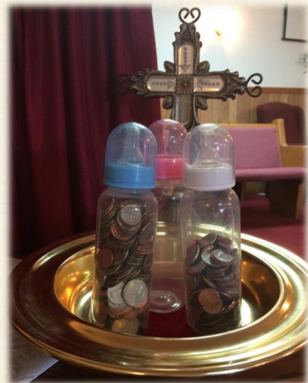
We are helping fill the baby bottles for Pathway of Hope. They are a pregnancy care center in Greenville, KY