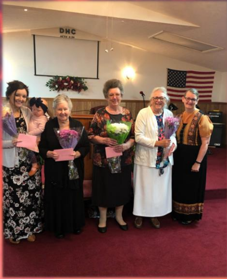
We honored our mother's on Mother's Day.