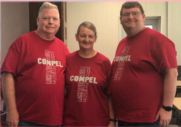
The Kentucky group had a wonderful time at camp!!!