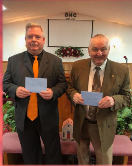
Fathers received a gift on Father's Day.