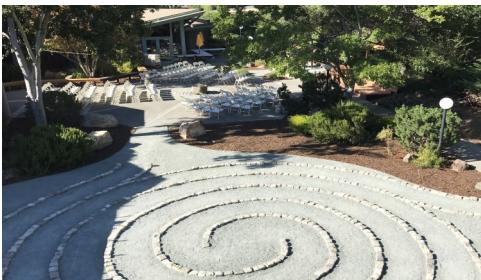
Courtyard & Labyrinth

The Sanctuary is a carpeted, theater style space with rows of fixed, cushioned pews that hold up to 400 people. The raised platform at the front is a perfect spot for speakers, musical groups, or other presentations. There is Wi-Fi, a piano, digital projector, roll-down movie screen, full sound system and multiple microphones. Restrooms, reception area, and breakout rooms are connected through a side door.