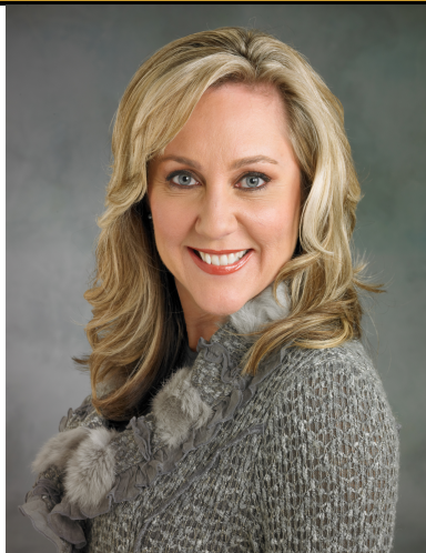
BIBLE TEACHER * SPEAKER * AUTHOR SINGER * CHOREOGRAPHER