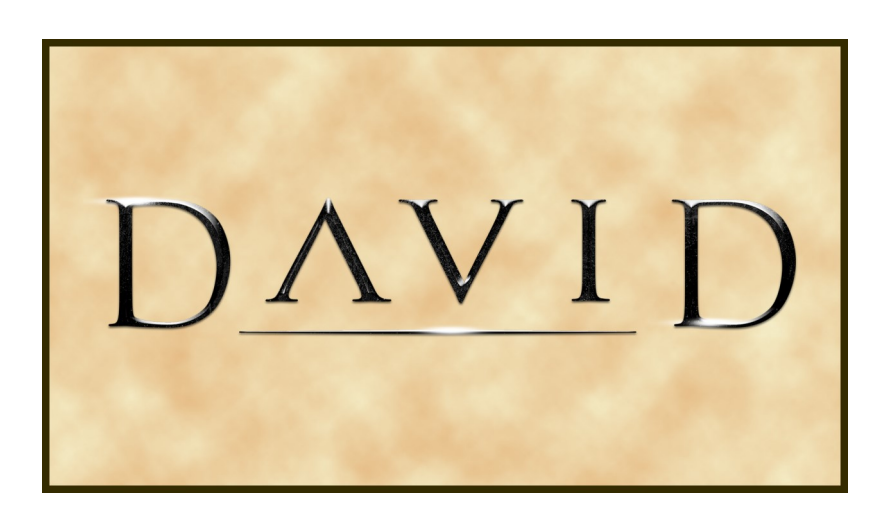
March 1, 2020 - David - Part 1