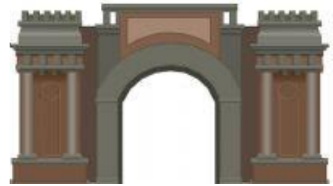
New Gate International Church

Audit students will receive %audit recognition+and recorded at the KCLI headquarters. All audit students must have an application for admission on file at the National Headquarters. Audit students must register and pay fees prior to course.