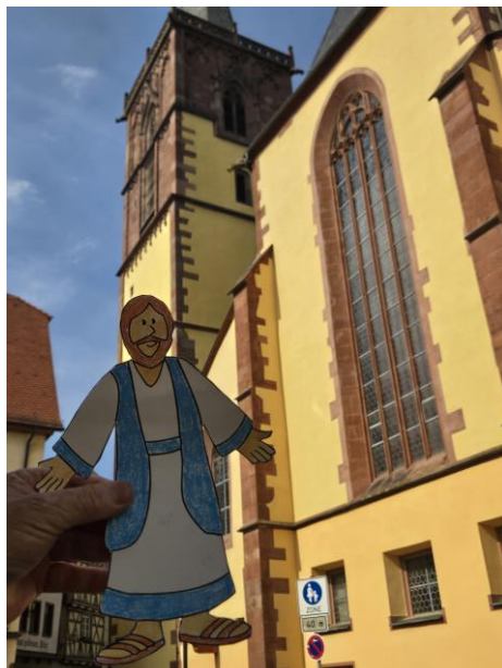
In front of one of the first Lutheran Churches 1544 in Wertheim with the Knapps