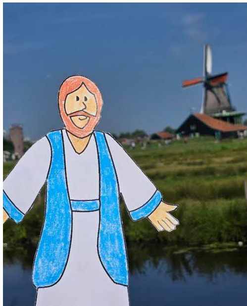
Flat Jesus in the Netherlands (Azznse Schans)

Zion Lutheran Church – A Joyous Oasis Sharing Life Through Christ! July 2025