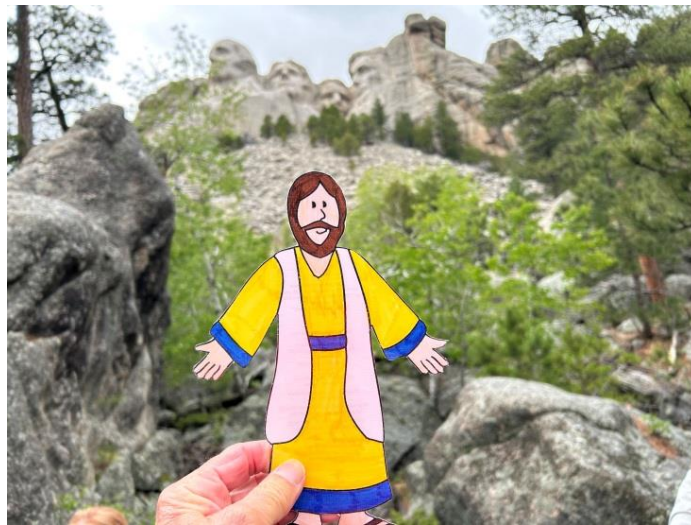
Flat Jesus at Mount Rushmore with the Coxes