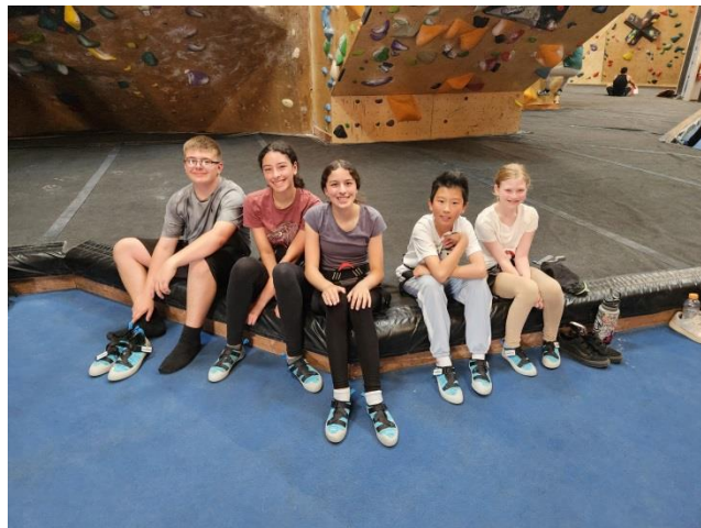
Indoor rock climbing - May 31, 2025