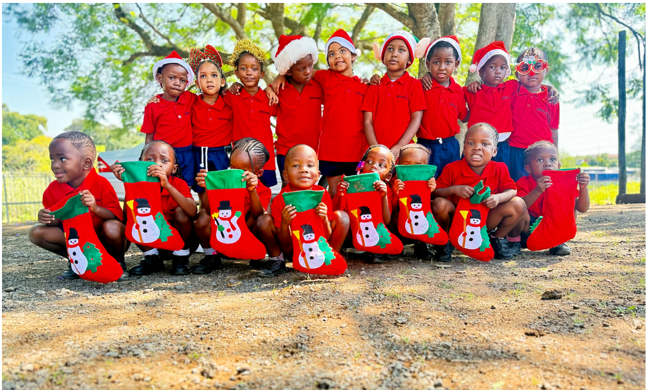
Christmas presents in South Africa