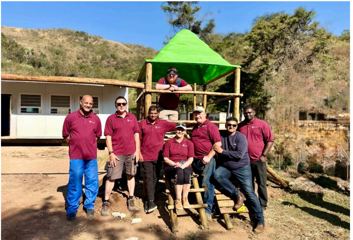
Repairs at Mtuketeli School and a new Playground