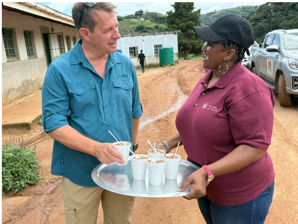
Soups is sponsored for 6,000 School Children