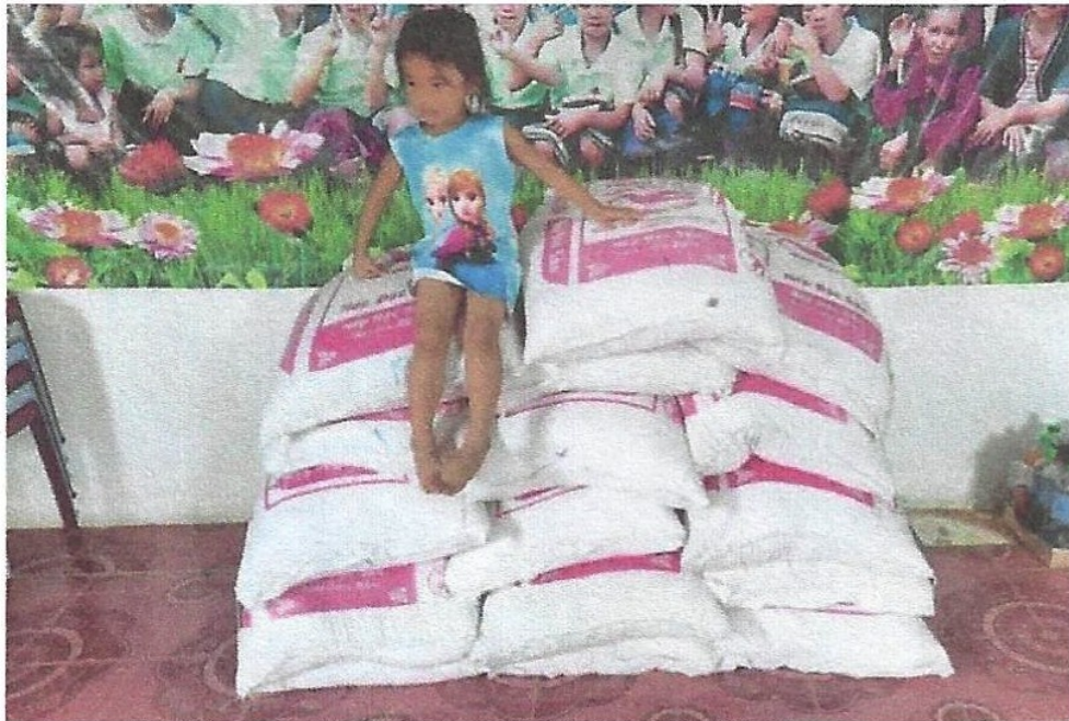
Rice for persecuted Christian