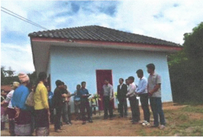
Sponsored Lao Church.