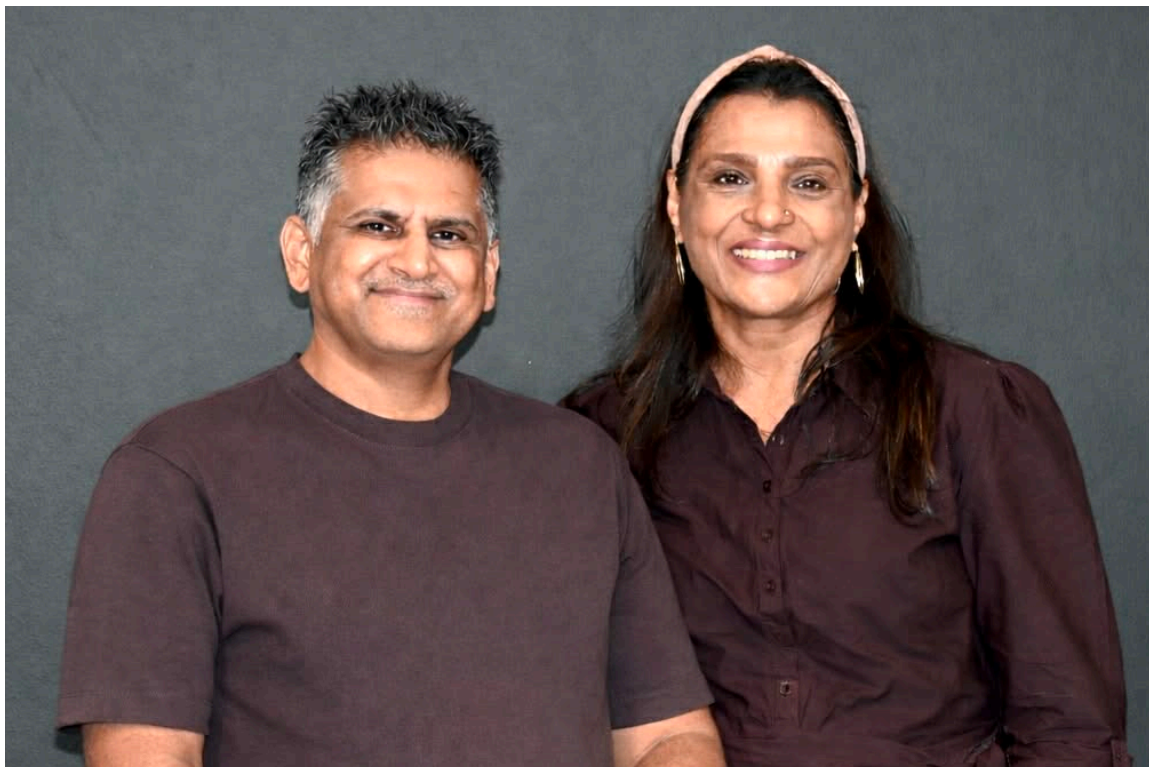
Our partners in South Africa can fulfill their mission because of our support.