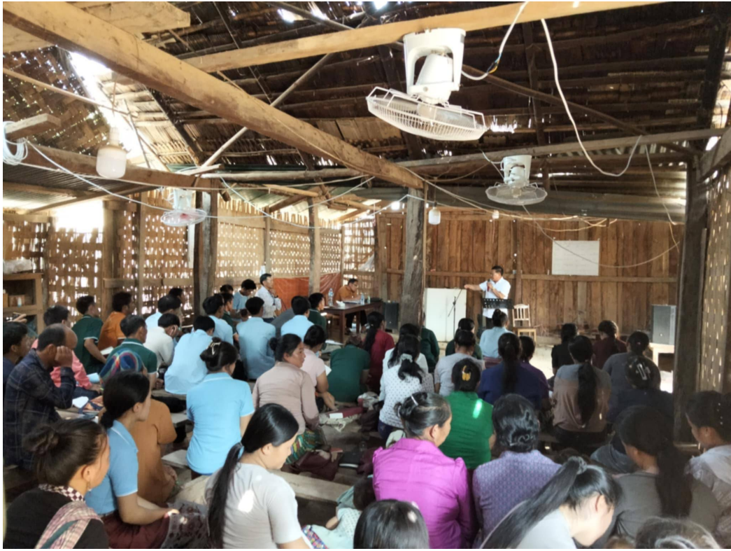
Hmong Church received a new Roof in Laos