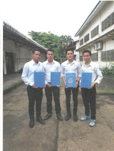
Educational Students graduated