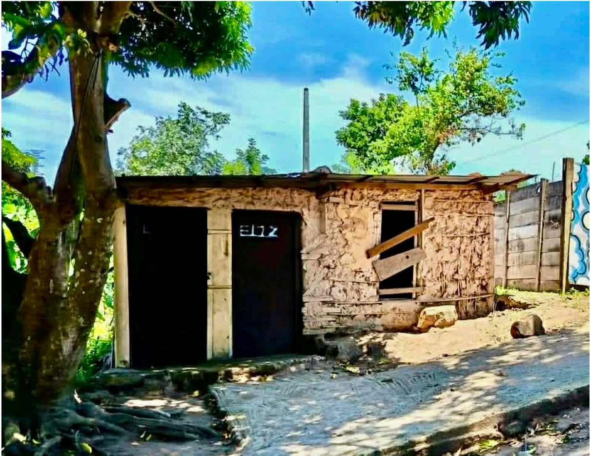
Old Madoni Tree Church