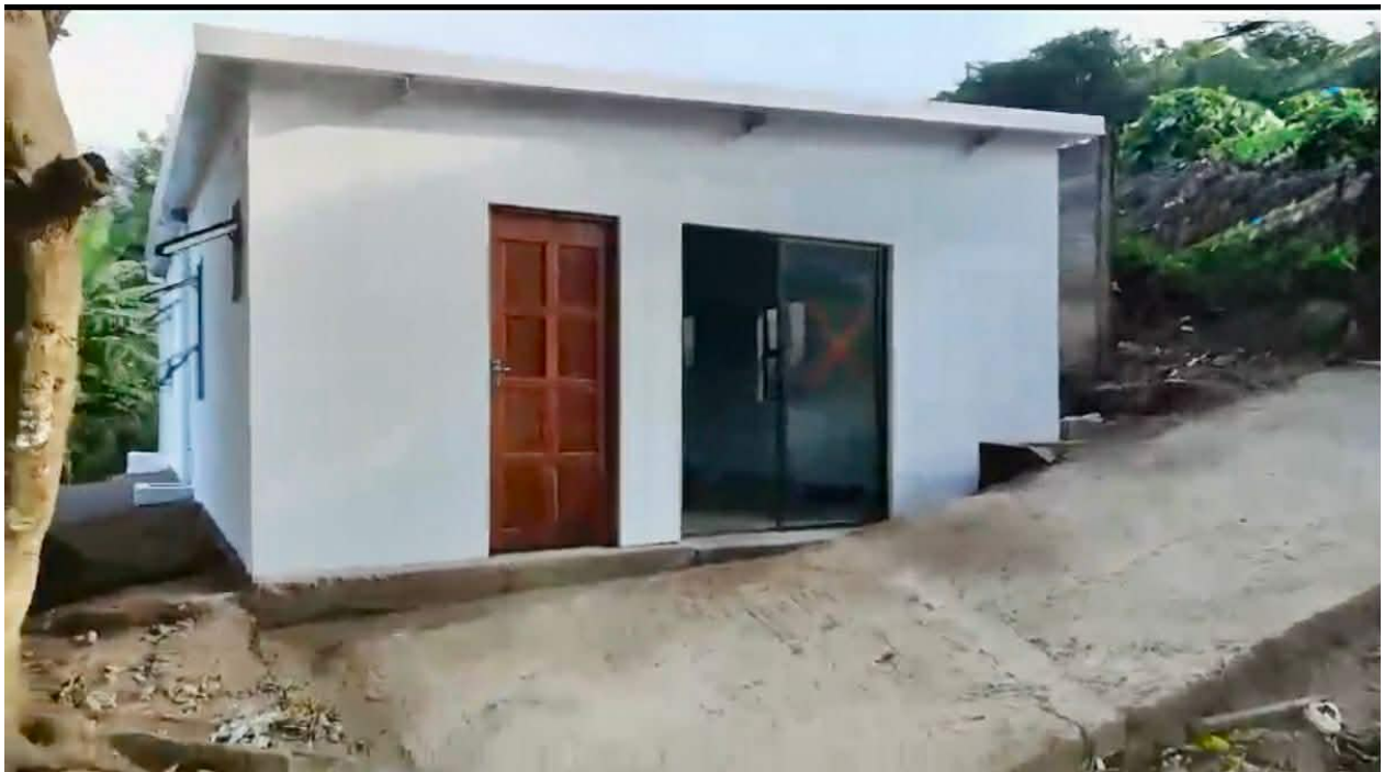
New Madoni Tree Church