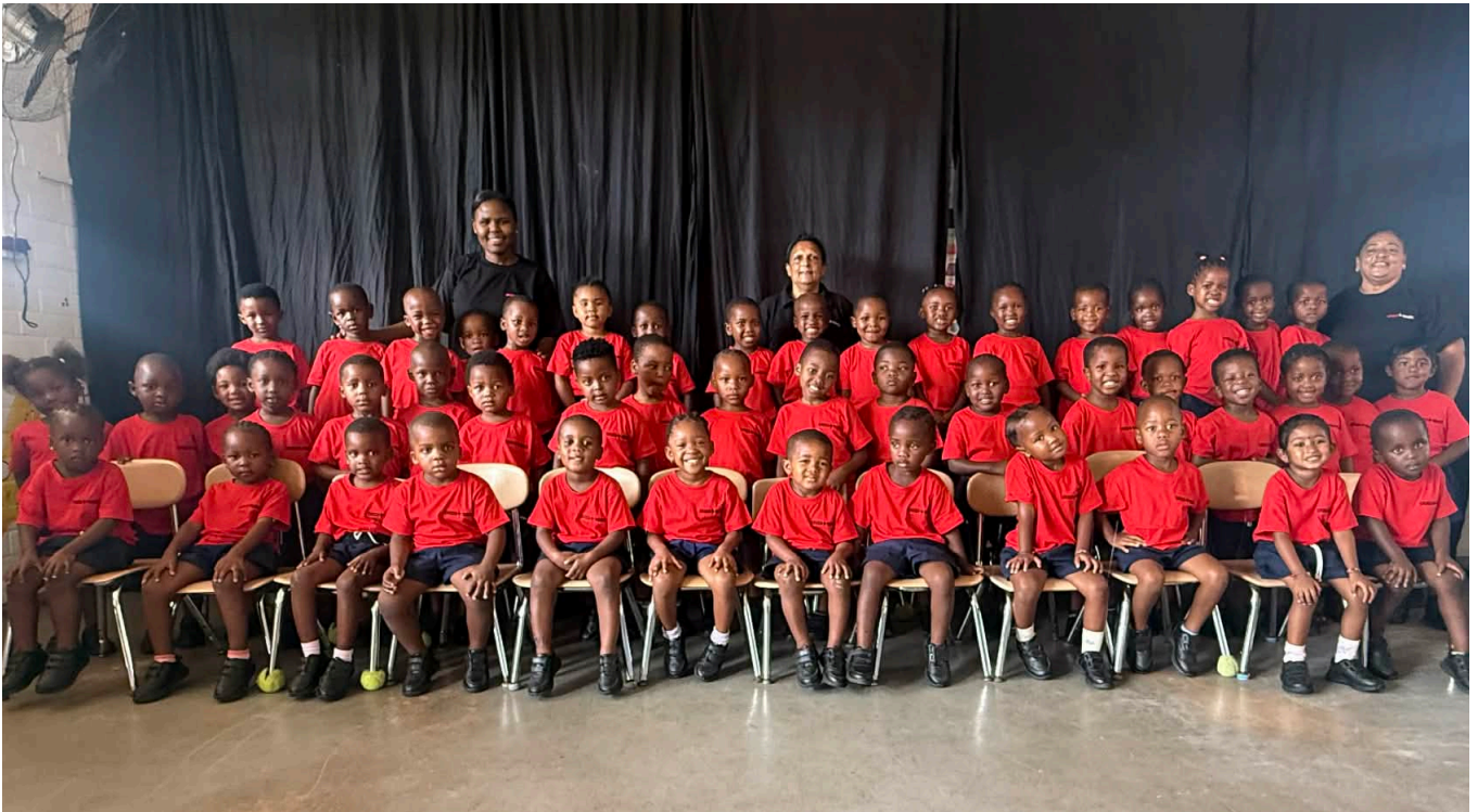
New uniforms for the Educare students in South Africa