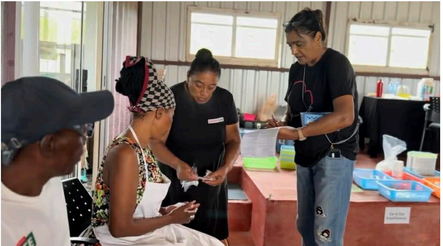
Pharmacy in South Africa