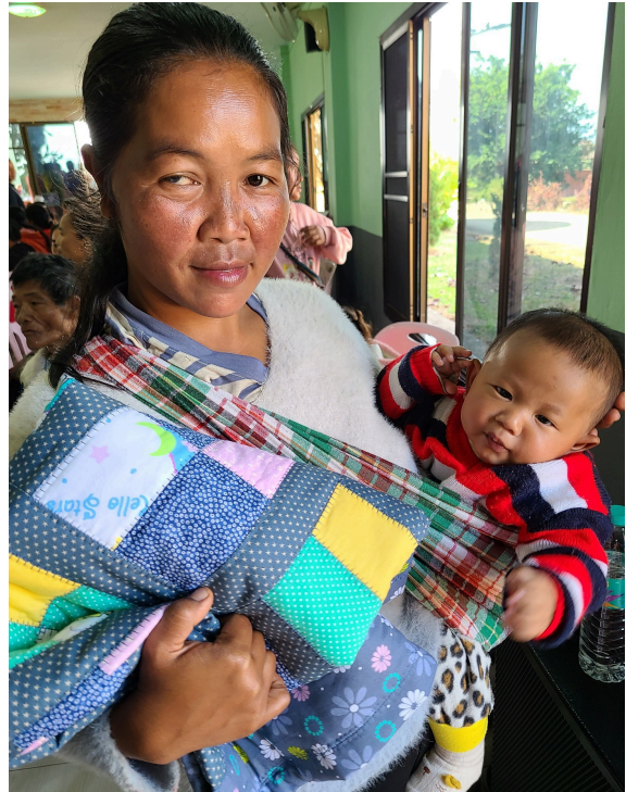
Children received quilts