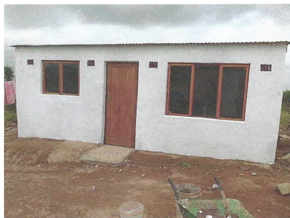
Mayika ladies rejoice in their new homes, Christas presents, One f the Mayika houses