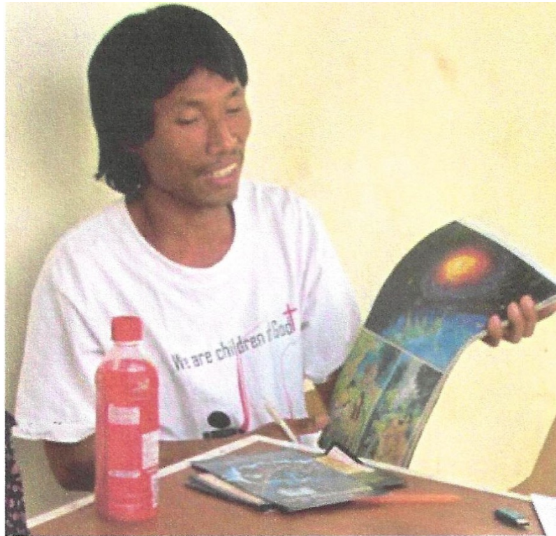
Thai boardcaster that we support. His broadcasts are heard locally in Thailand