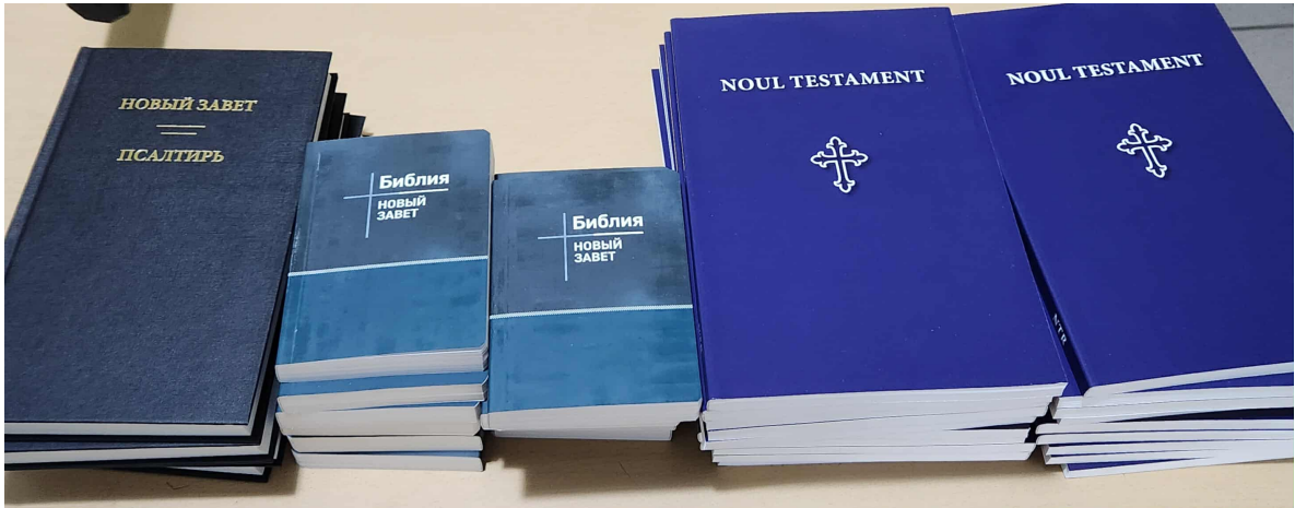
Bibles Given to New Believers