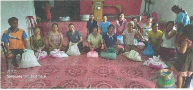
Rice for persecuted Christians in Laos