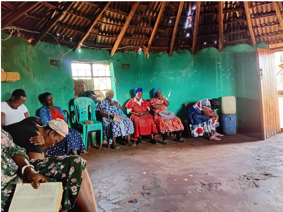
South African ladies met for discipleship