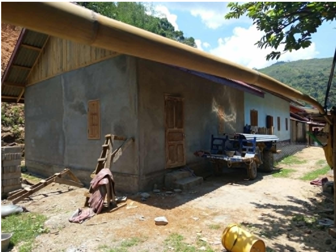
Lao Church was finished inside and out