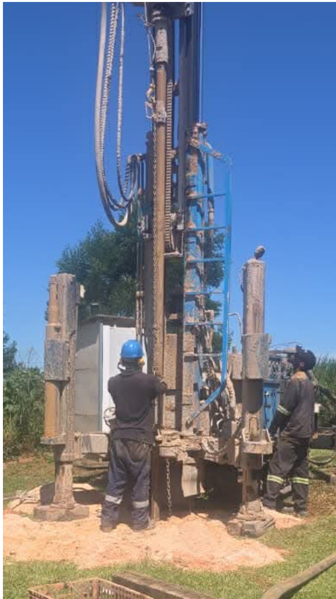
Drilling for water at Mtuketeli