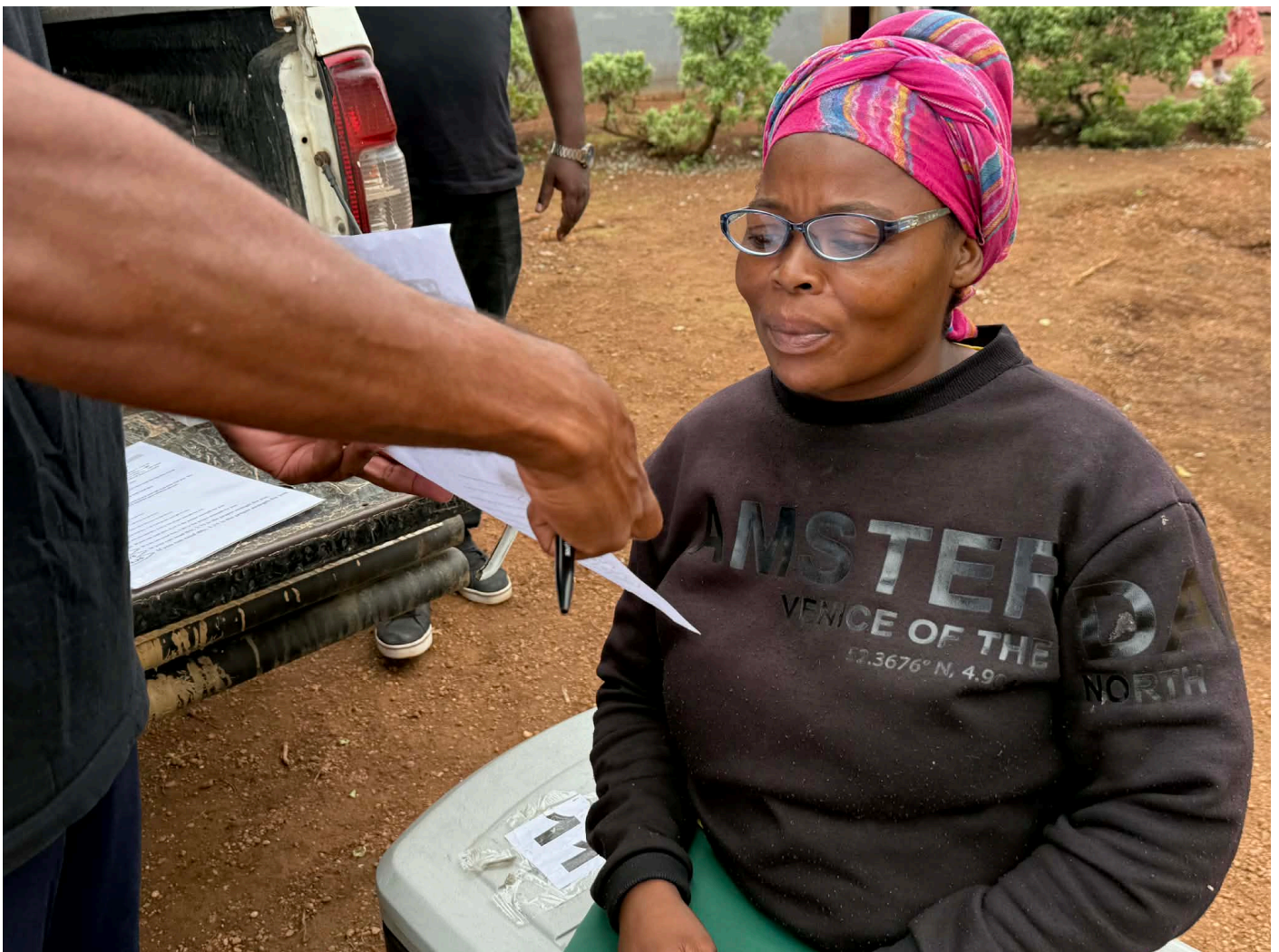
Glasses given in South Africa