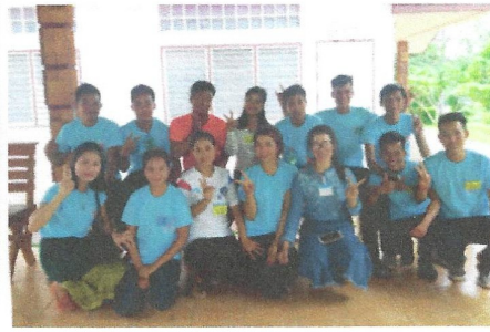
Lao scholarship students