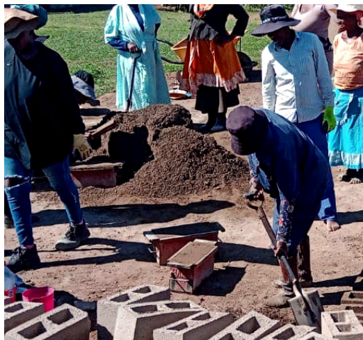
Building bricks in Mayika

Scholarships were provided to several students in Guatemala at the high school, technical, or university level. 22 outstanding students in Laos were given scholarships for higher education. We believe education is essential for our Christian young people to move forward as world - changers in their countries.