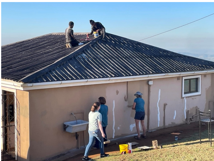
Painting the Hope Center,, South Africa