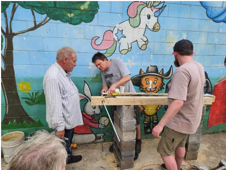
Engineers a Work on the Platform