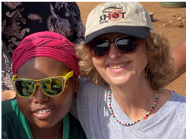
Sunglasses in South Africa