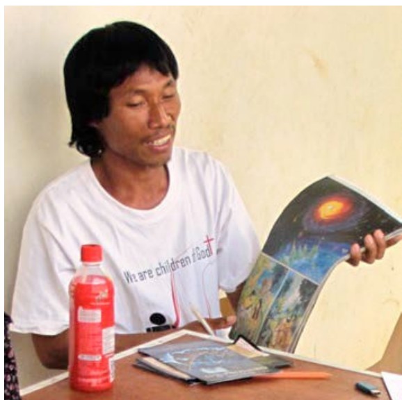
Thai Broadcaster that we support His broadcast are heard locally in Thailand