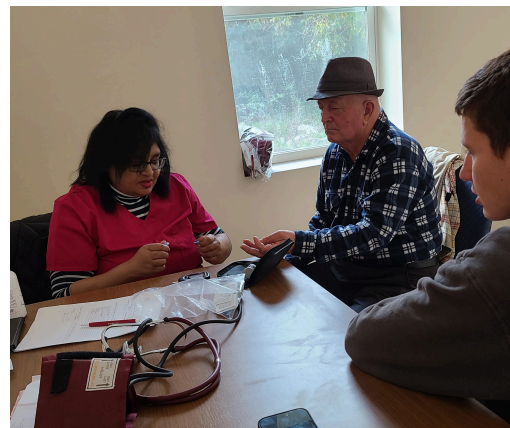
Treating patients in Moldova