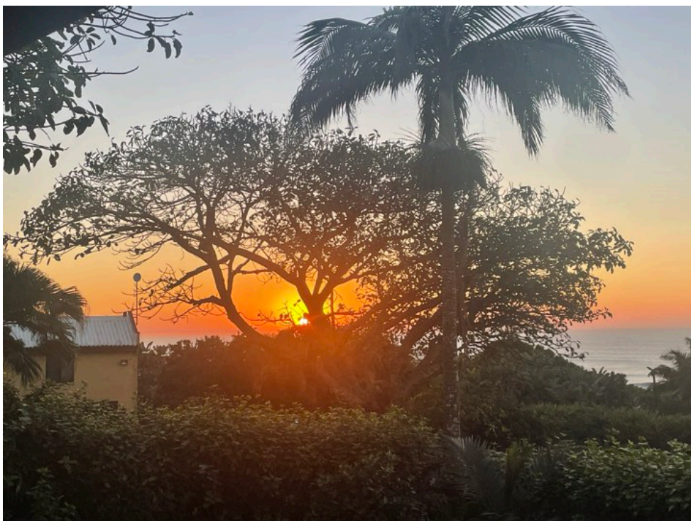
South Africa Sunrise