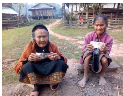
Lao Widows Receive Support