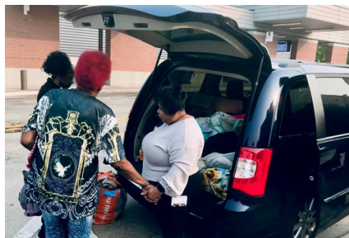
Clothes distribution in Rockford