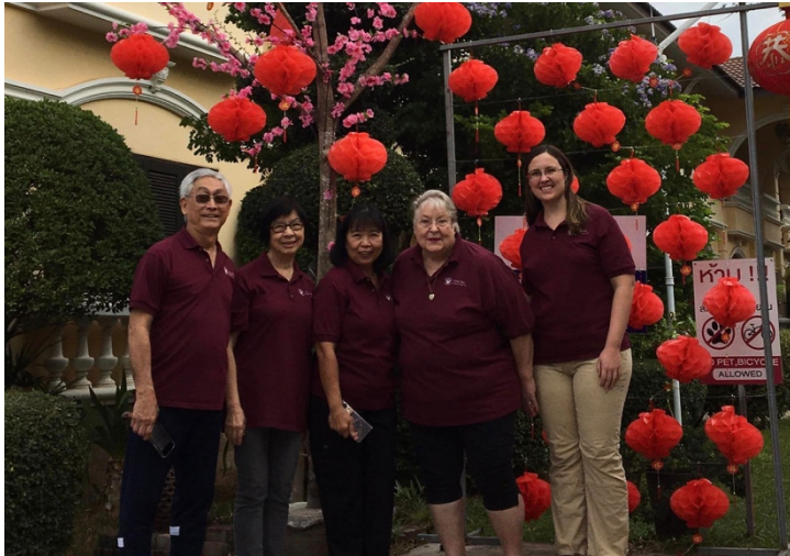
Nong Khai Medical Team