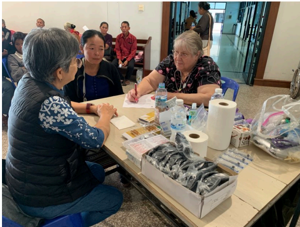
Nong Khai Medical Clinic