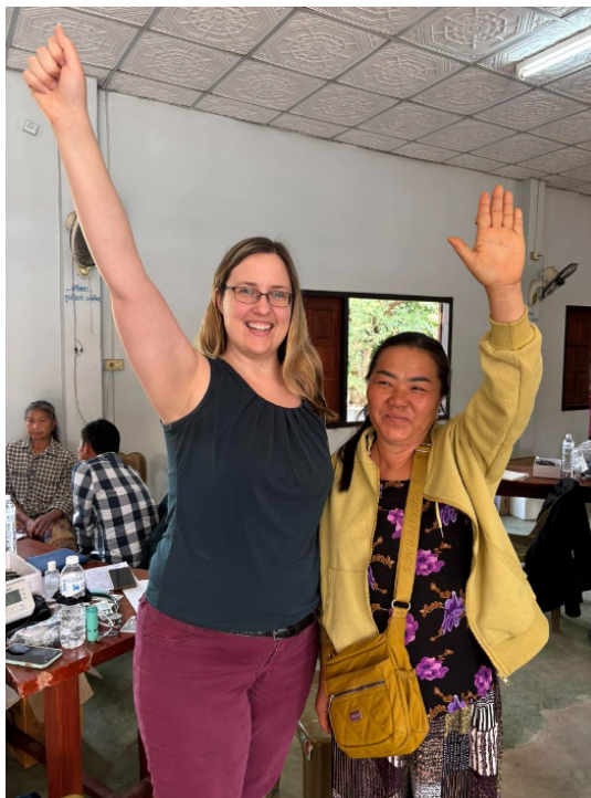
Rejoicing after a Healing