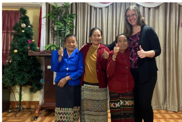
Visiting Widows in Laos