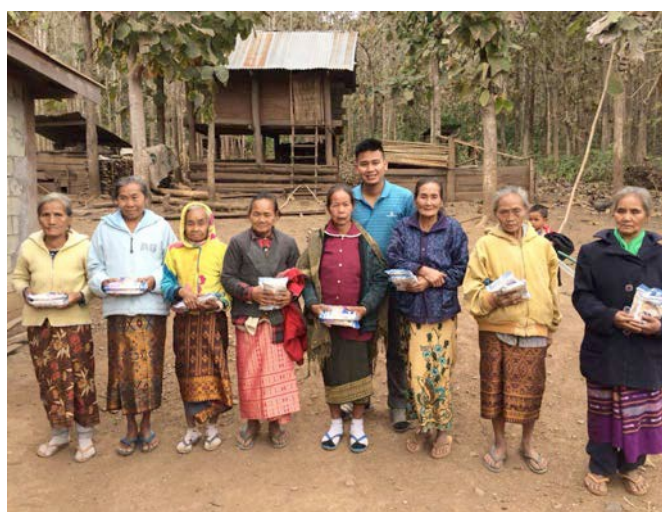
Pastor visits Lao widows