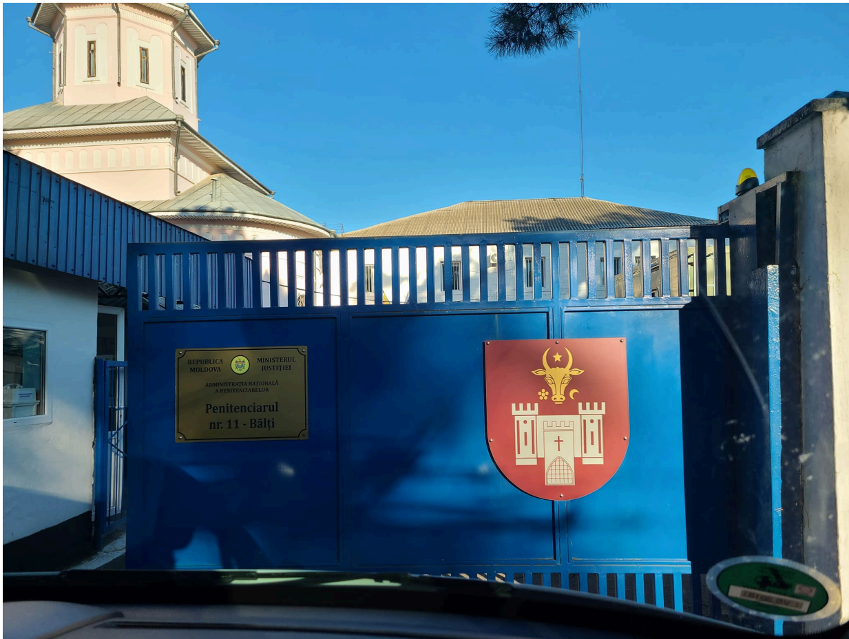
Balti Prison, Moldova