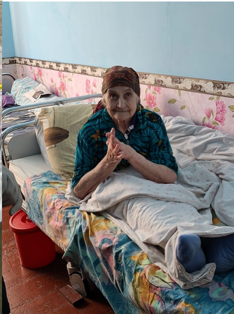
Nursing Home Patient in Moldova