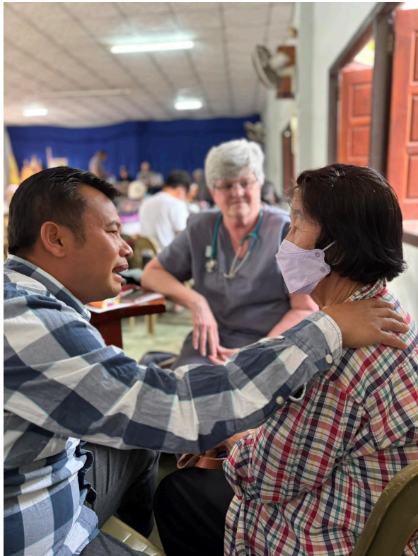
Accepting Jesus in Thailand