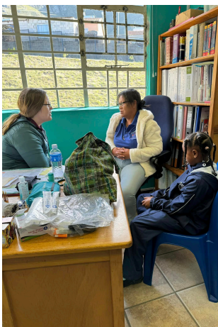
Patients seen in South Africa