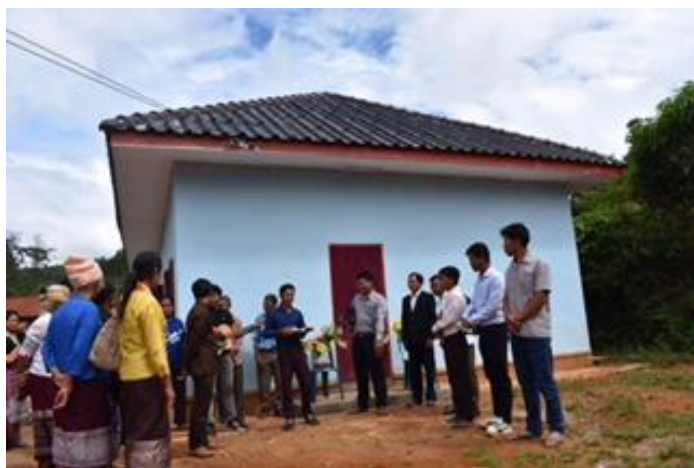
Sponsored new church in Laos