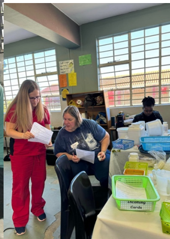
Pharmacy Consult in SA