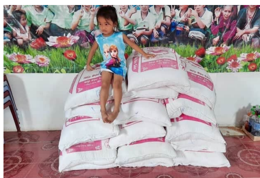
Lao Christians receiving rice