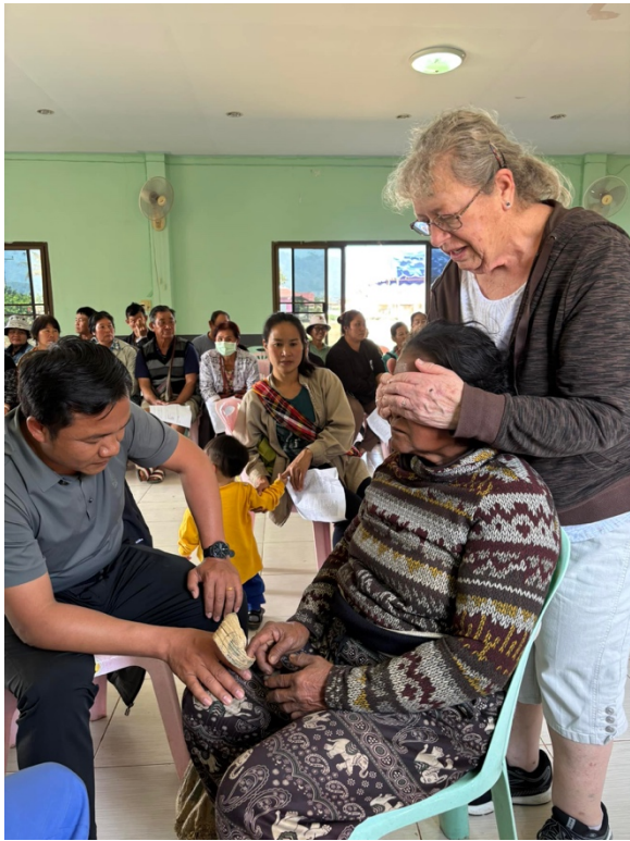
Eyes Healed After Prayer