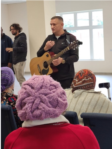
Worship in Moldova