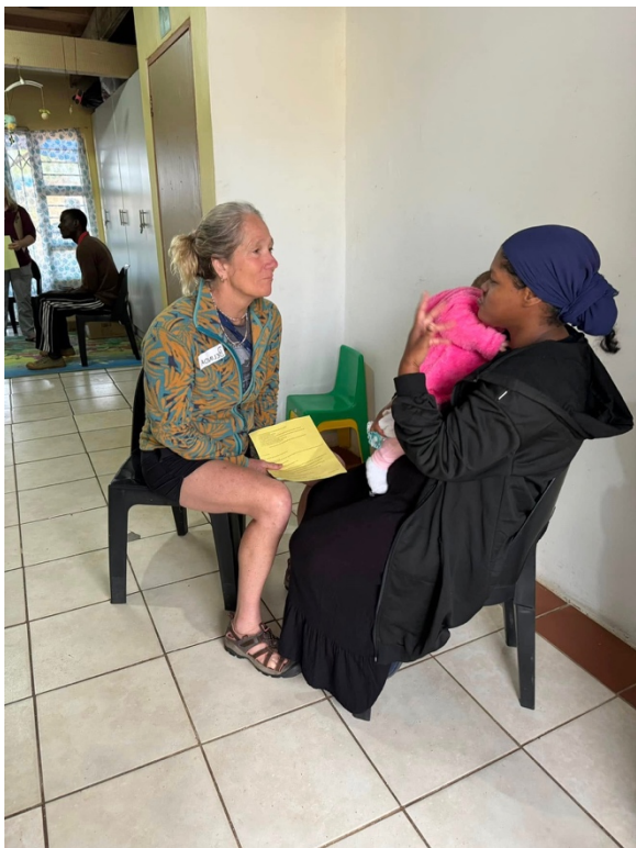
Spiritual Counseling in South Africa