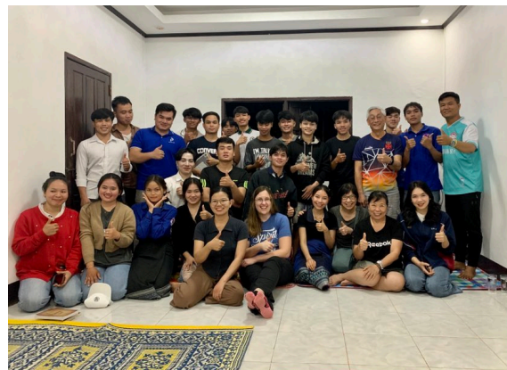
Visiting Lao Scholarship Students