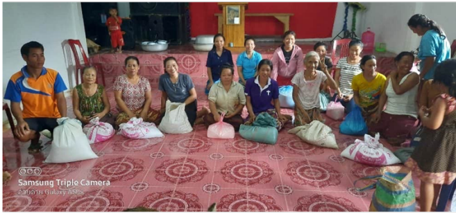
Rice for persecuted Christians in Laos