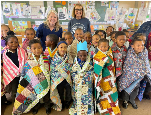
Giving Quilts in South Africa