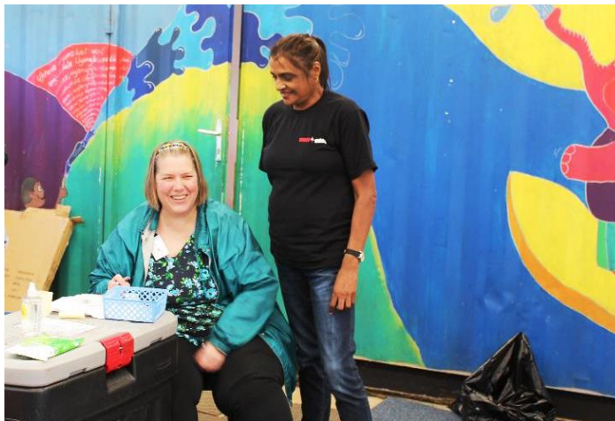
Pharmacy in South Africa