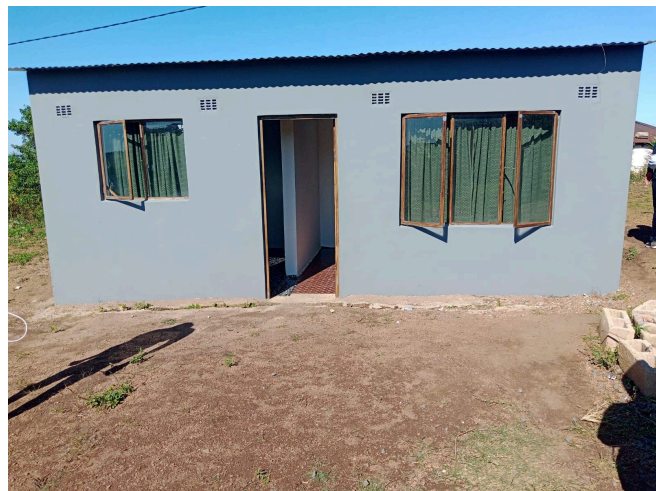
Finished Mayika House