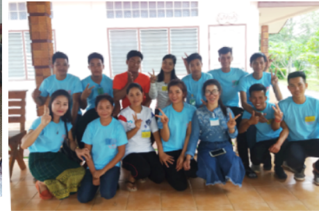
Lao scholarship students