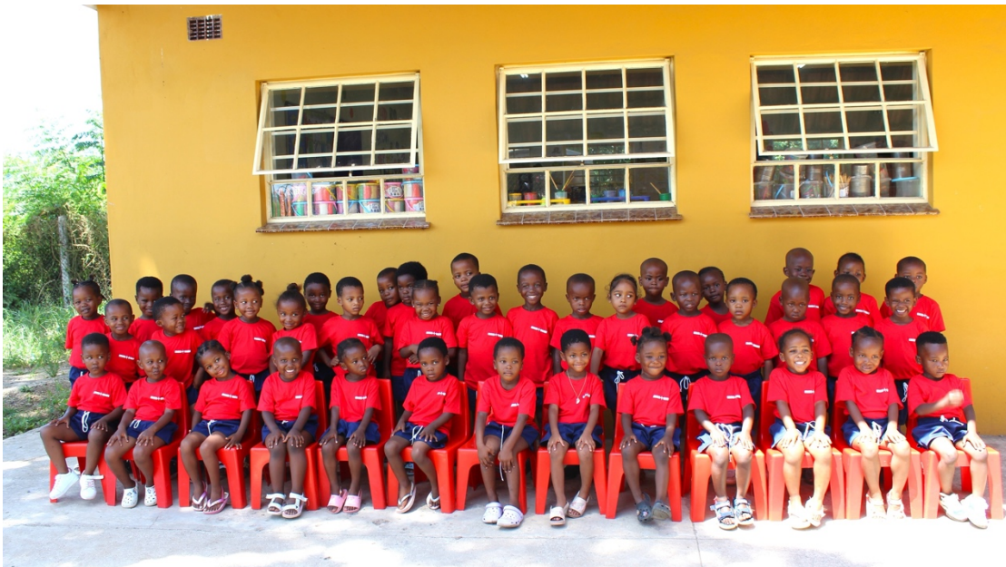
New uniforms for the Educare students in South Africa