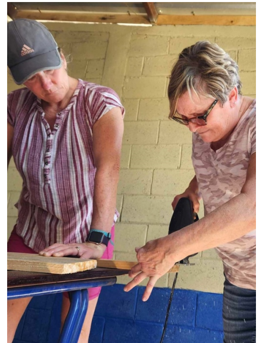
Thankful for the power tools