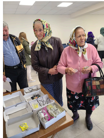
Glasses in Moldova