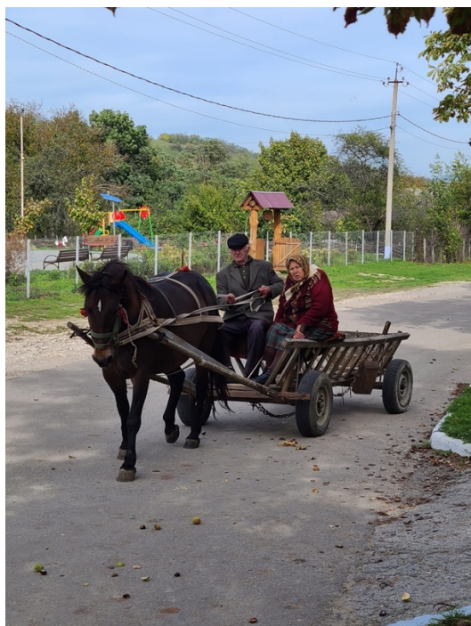
Horse Drawn Cart In Moldova