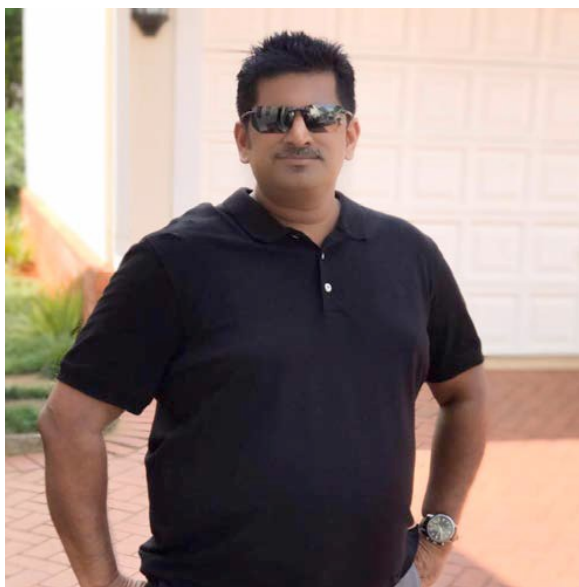
Our partners in South Africa can fulfill their mission because of our support.