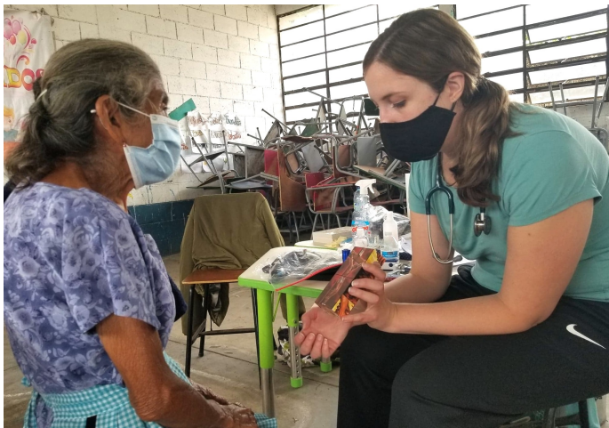
Sharing the Gospel