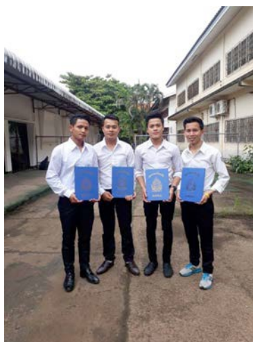
4 of our Graduates in Laos