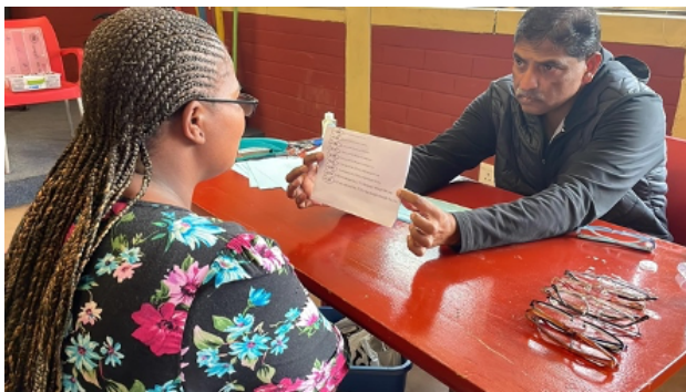
Testing vision in South Africa