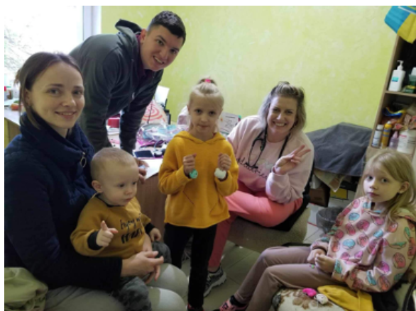
Treating a family in Ukraine