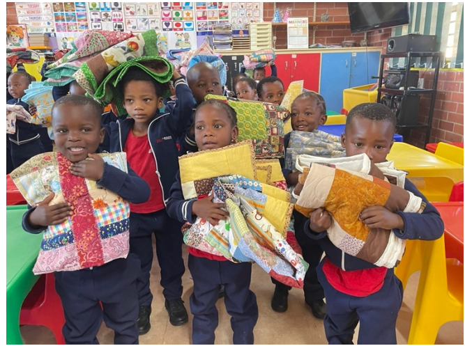
Children received quilts