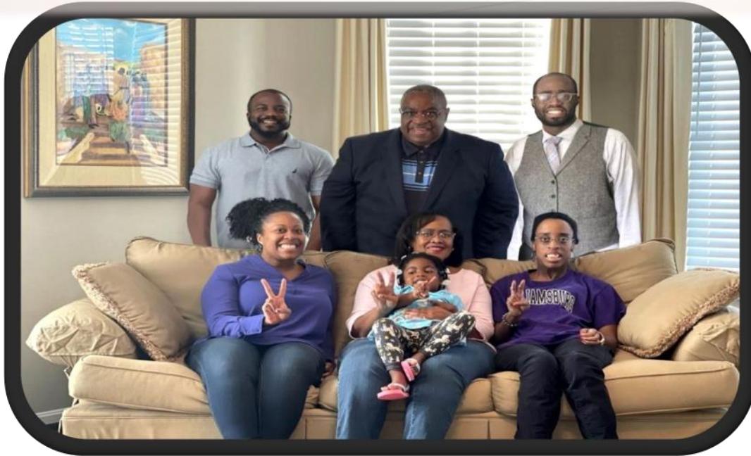
The Foster Family