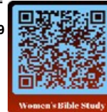
Women's Bible Study

11 6:00AM—Prayer Call (605) 472-5512, Code 772576# 7PM WEM Bible Study •https://us02web.zoom.us/j/87171726645?pwd=anFGaTlwZ1lsaEtiL3ROdiBNQVpFQT09