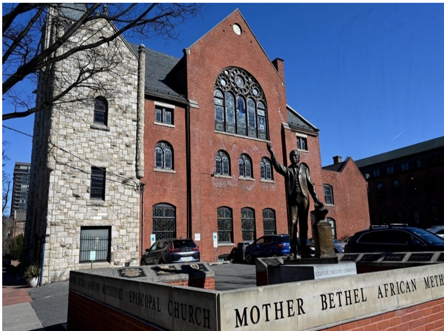
A bronze statue of Bishop Richard Allen outside Mother Bethel AME Church on Tuesday.