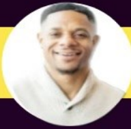
MINISTER TYLER ROUSE