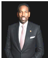
Andre Dickens MAYOR