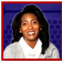
THE FOURTH WORD THE WORD OF DIVINE SADNESS

“My God, My God, Why Hast Thou Forsaken Me”