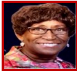
THE THIRD WORD THE WORD OF AFFECTION

“Woman, Behold your Son, Behold your Mother”