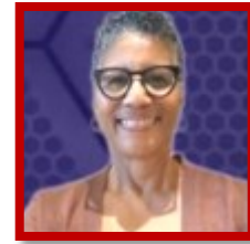
THE FIFTH WORD THE WORD OF PHYSICAL SUFFERING “I Thirst” John 19:28