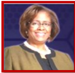
THE SECOND WORD THE WORD OF PROMISE “Today you will be with me in Paradise” Luke 23:43