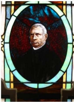
Bishop Henry McNeal Turner

The question arises: who are these revered saints and why were they selected to be memorialized? No one knows the answer; however,