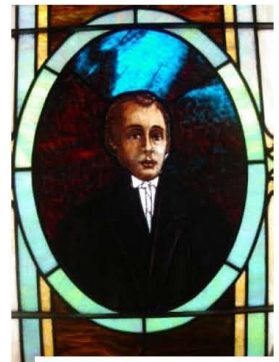
Bishop Richard Allen

Richard Allen is the founding father of the AME church -- the first fully independent black denomination in the U.S. Allen's March 26 th Feast Day recognition on the Episcopal Church's Liturgical Calendar is a testament to the breadth of his greatness. A tireless minister, abolitionist, and reformer, Allen influenced nearly every black leader of the nineteenth century, from Fredrick Douglass to W. E. B. Du Bois.