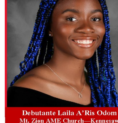
Mt. Zion AME Church—Kennesaw