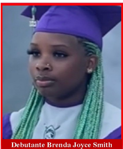
Big Bethel AME Church—Atlanta