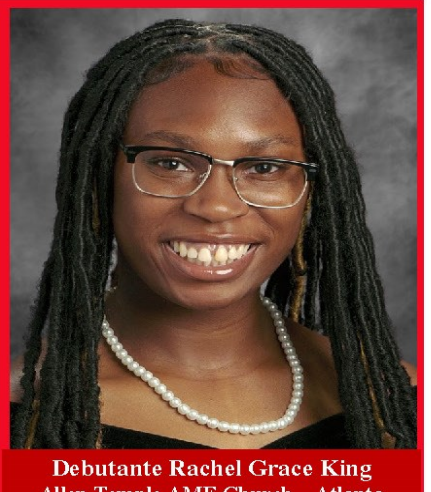
Allen Temple AME Church—Atlanta