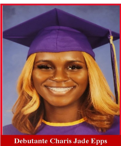
Big Bethel AME Church—Atlanta