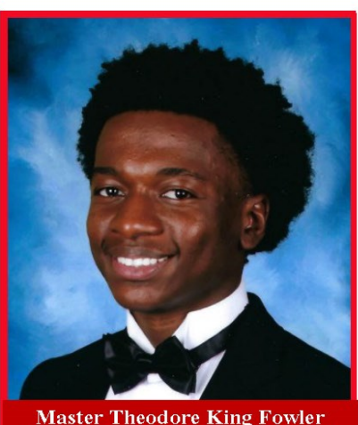
Master Theodore King Fowler Gray's Chapel AME Church—Adair sville