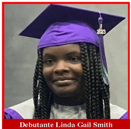
Big Bethel AME Church—Atlanta