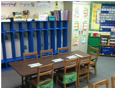
K4 Room View 1