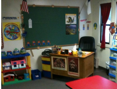
K4T View 1