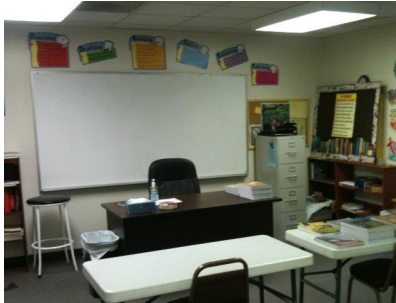
High School Classroom