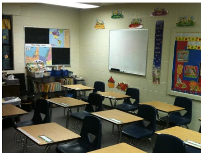
3rd/4th Room View 2