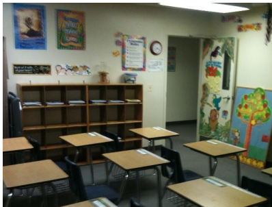
3rd/4th Room View 1