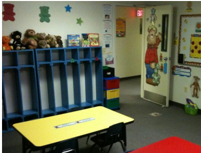
K4T View 2