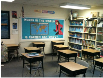
Middle School Classroom