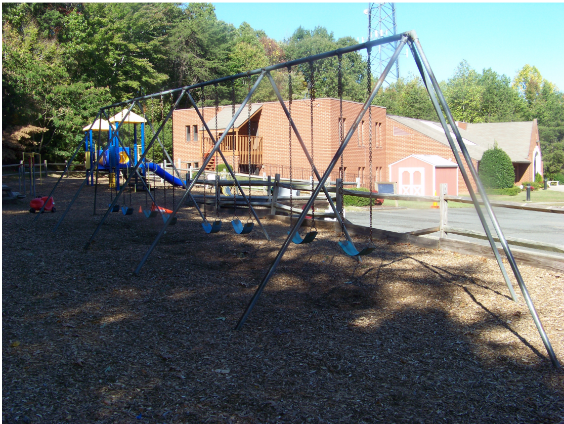
CCS Playground Area