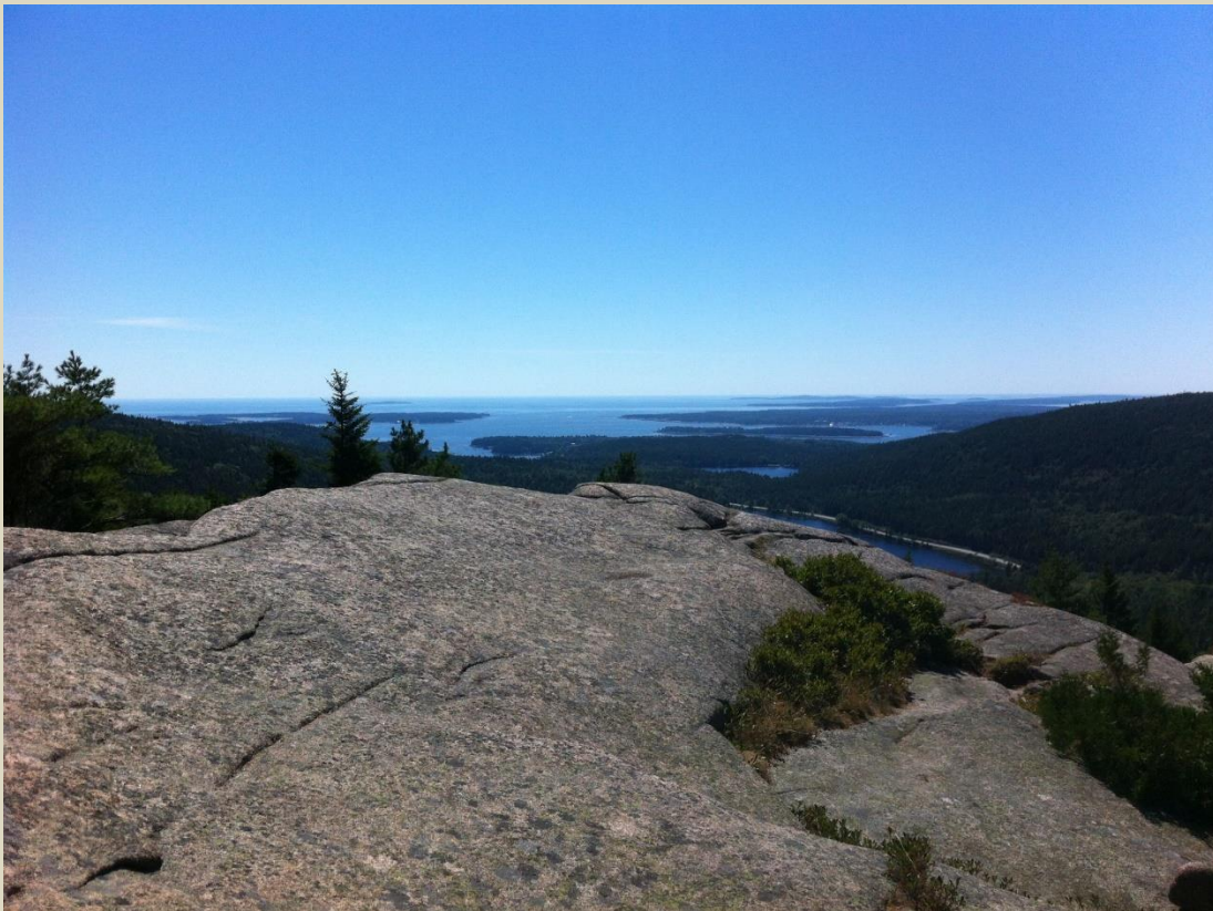
ReWilding Acadia National Park, ME.

Integrity, ethics, and professional behavior by all individuals associated with VGI are essential in reducing waste in resources, and unnecessary psychological and emotional stress. This is required in order for students, faculty, staff, and the public to have trust in Viridis Graduate Institute.