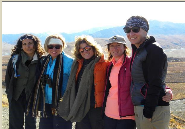
ReWilding Denali National Park, AK. 2017