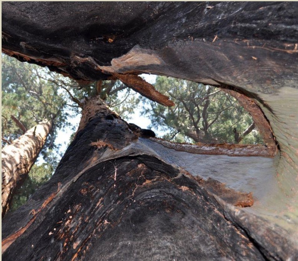
ReWilding Zion National Park 2017

Cancellation Policy: determined by location