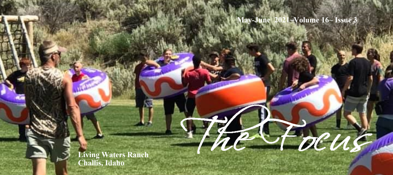
Living Waters Ranch Challis, Idaho

“A network of churches cooperating to assist each other in fulfilling the Great Commission.”