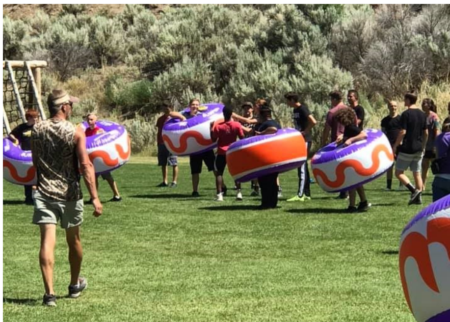
Outdoor games are amazingly fun!

Are you ready for the BEST WEEK OF YOUR YEAR? It's a week you don't want to miss!