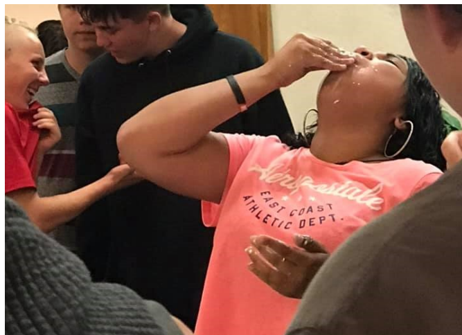
Challenges are hilarious!