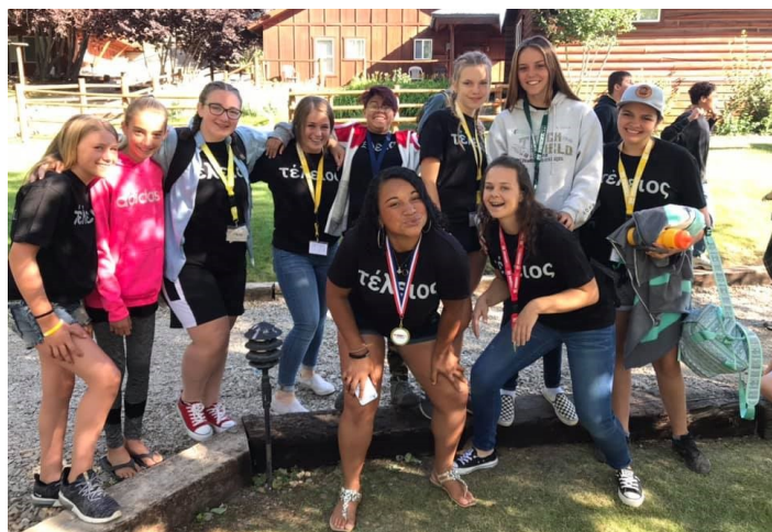
Friendships in the Lord bond us!