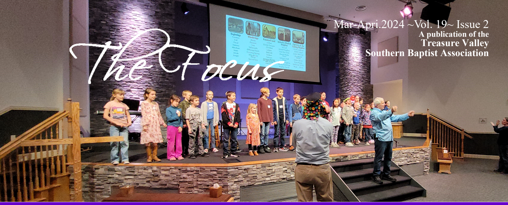
"A network of churches cooperating to assist each other in fulfilling the Great Commission."