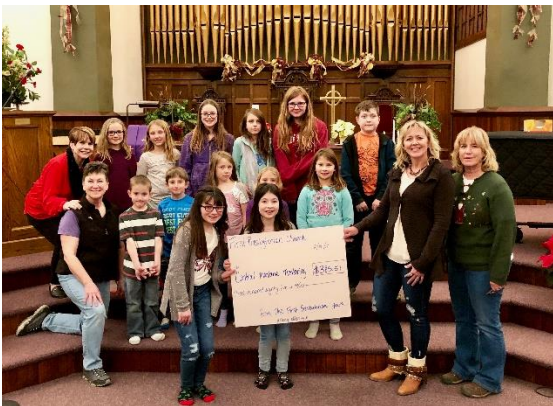
Noisy Offering Donation