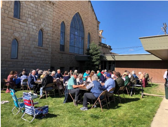
"Pack the Pew" gathering

To summarize: we are modest-sized congregation which reflects the people of Central Montana - ranchers and professionals, blue-collar working families and retirees, hard-working people of various backgrounds and life paths who share our love of God with each other and others in our community. We are aware that we can do more and do it better. We care deeply for one another and for our church as a whole. We strive to respect, support and love one another as Jesus has called us to do.