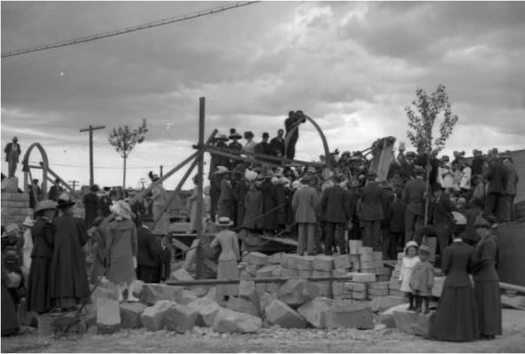
Construction of new church 1912