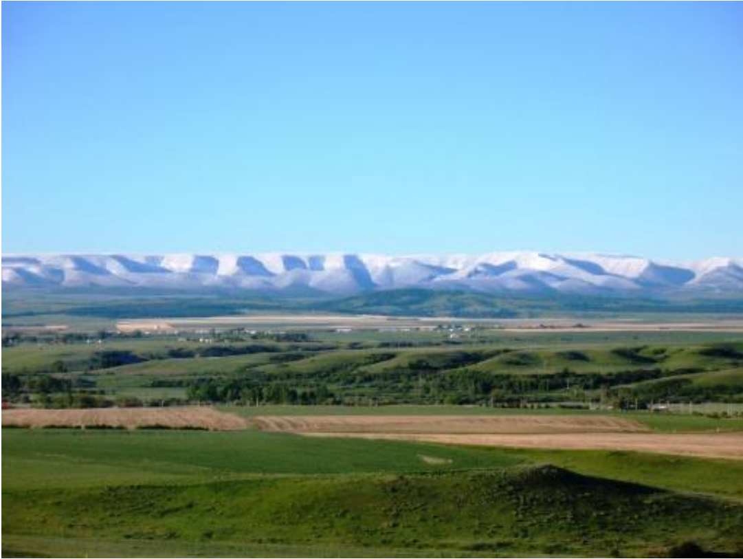
Snowy Mountains Outside of Lewistown

We feel blessed to live in Central Montana and to be part of the First Presbyterian Church faith community. We are blessed to have a building as beautiful as ours.