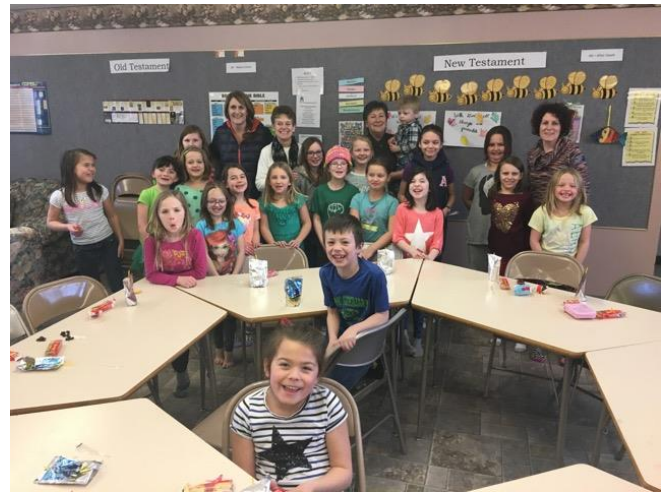
Church school kids

Moving toward God, forward in faith and outward as disciples of Jesus Christ