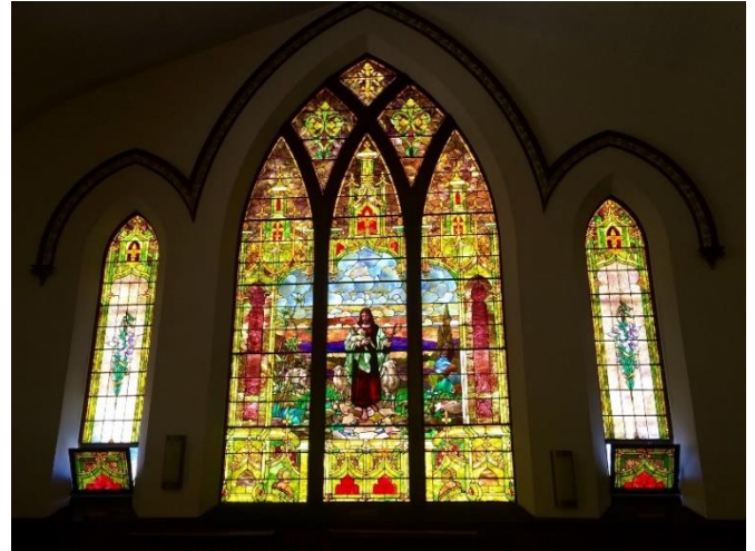
One of Our Stained Glass Windows