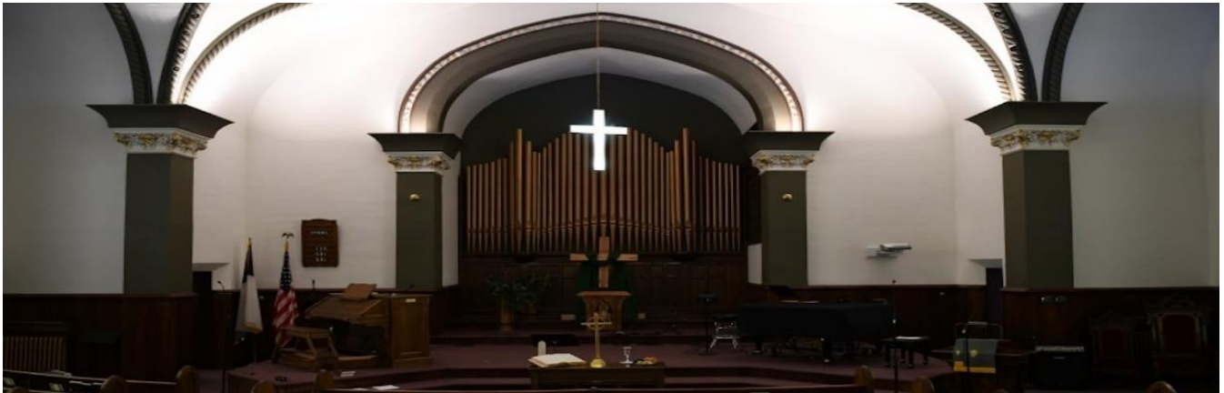
Front of the Sanctuary

We offer one worship service each Sunday at 10:30 a.m. Our service includes Scripture, communal prayer, children's message, a mix of older hymns and newer praise songs and, of course, a sermon or message. Our praise team/choir leads our music, and we occasionally invite members of the congregation and community to perform special music.