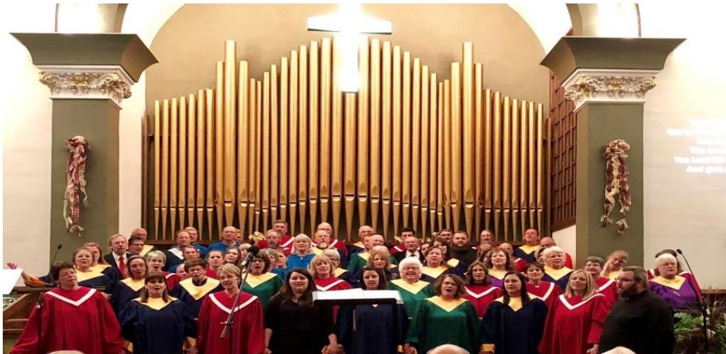
Christmas Cantata Choir

We believe it tells you something about who we are when you know some of the missional activities in which we take part. We connect with our community in these ways: