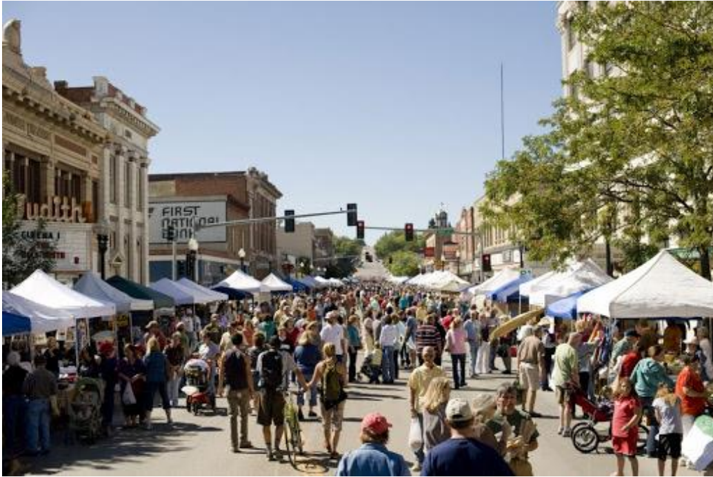
Annual Chokecherry Festival

Located in the center of Montana, Lewistown is a great place to live, work, worship and raise a family.