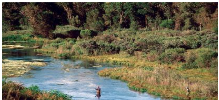
Fishing on Spring Creek