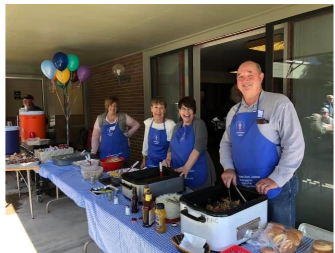
"Pack the Pew" Food Servers