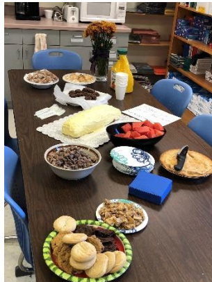
Treats for Teachers