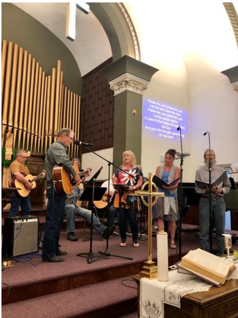
Praise Team Singers

Moving toward God, forward in faith and outward as disciples of Jesus Christ