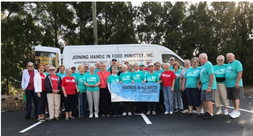
(Editor's note: The above picture was taken pre-COVID-19)

Joining Hands in Food Ministry, a cooperative effort between Gloria Dei and the First Presbyterian Church of Leesburg held its first food distribution in October of 2010. In 2013, JHIFM was granted 501(c)(3) status. Thanks to a bequest from a GDLG member, a new van was purchased in 2017. JHIFM is an authorized partner agency of Second Harvest Food Bank of Central Florida and a 2018 Grant Recipient of the United Way of Lake and Sumter Counties. Gloria Dei Thrivent Financial members use their Action Team grants to fund $250 of food for each month.