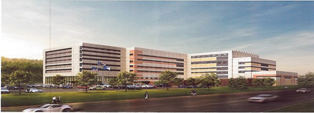
CITY OF RICHMOND JUSTICE CENTER April 12, 2011

We pray for all people who are involved in any way in criminal justice. We pray for police, judges, and correctional officers, that they may see all in their care as their brothers and sisters who God created. We pray for these beloved of God, who are now dependent on these systems, that they are safe and receive loving justice.