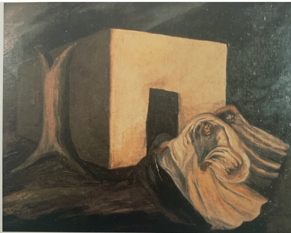
José Clemente Orozco, The White House

Imaging the Word Volume 3, United Church Press, Cleveland, Ohio José Clemente Orozco, The White House