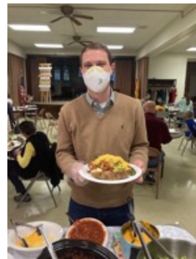
GOOD FOOD. A few shots from the Wednesday Lenten studies.