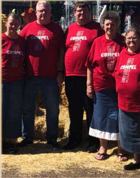
Showing our Camp spirit in Pigeon Forge!! Compelling them!