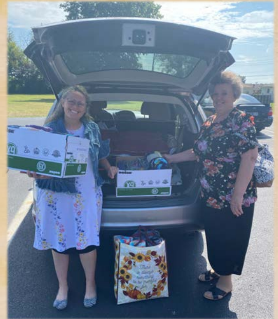
Items were gathered for "Fostering Jesus' Love"