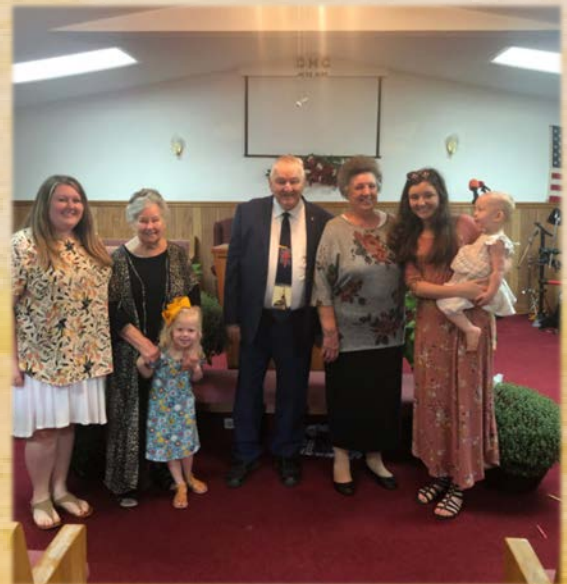
We honored our grandparents. It was great to have grandchildren and great grandchildren in church to help celebrate.