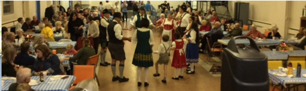
Above: The Edelweiss Schuhplattlers dance.