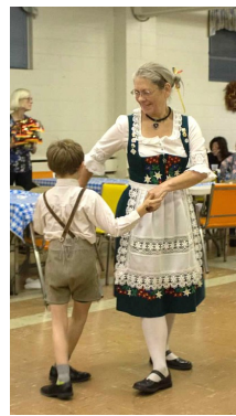
At Right & Below: The Schuhplattlers demonstrate several traditional dances, and encourage the audience to join them.