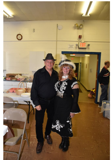
Right: Guests posing for a nice picture!