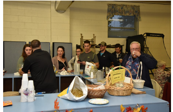
Above: Friends having a great time hanging out at that the Biergarten!