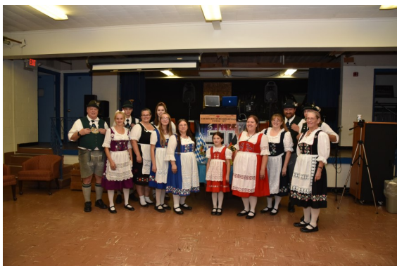
Left—Right The Edelweiss Dancers.