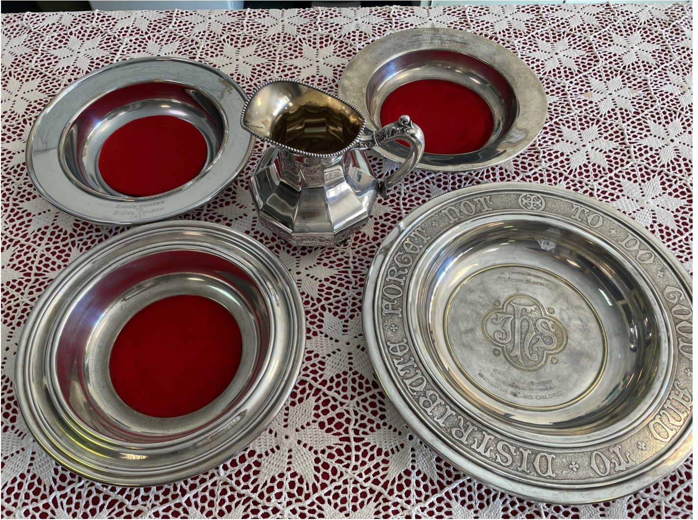
Historic pitcher - 1897 - in the Fireside Room