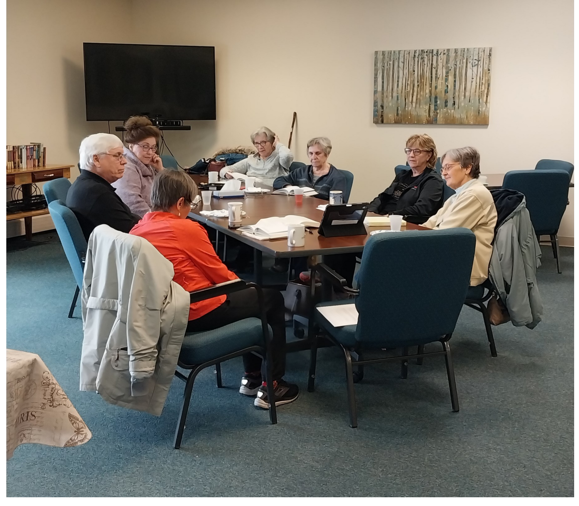
The Book Group met on February 13th for brunch and book discussion.