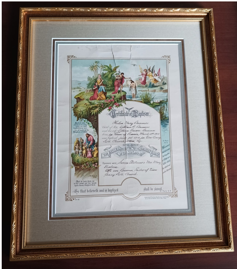
Helen's baptismal certificate.