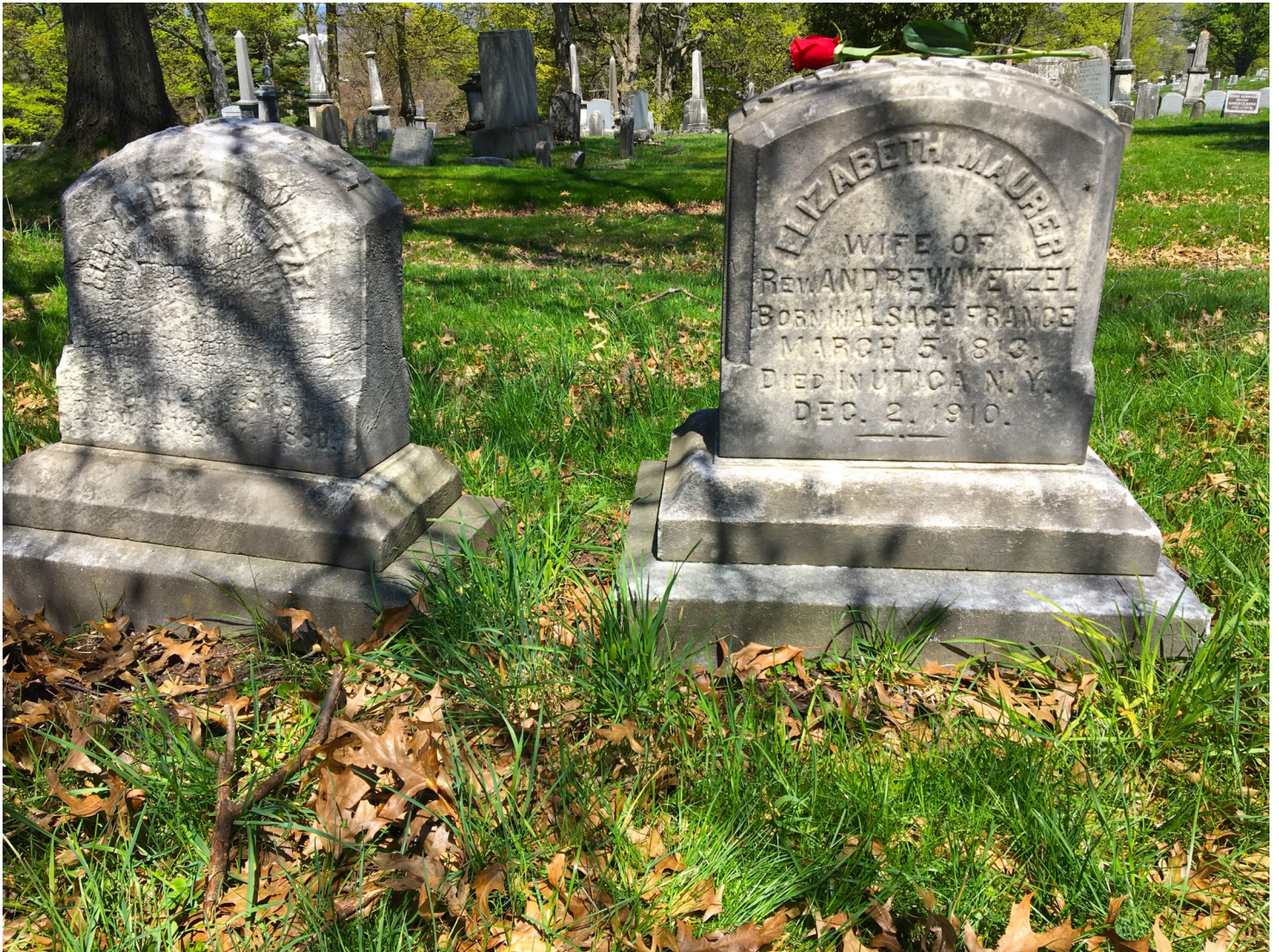
Wetzel Family Plot, Forest Hill Cemetery, Mothers' Day 2022.