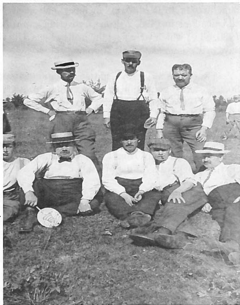
Members of Zion's Young Men's Society at their annual picnic, around 1915