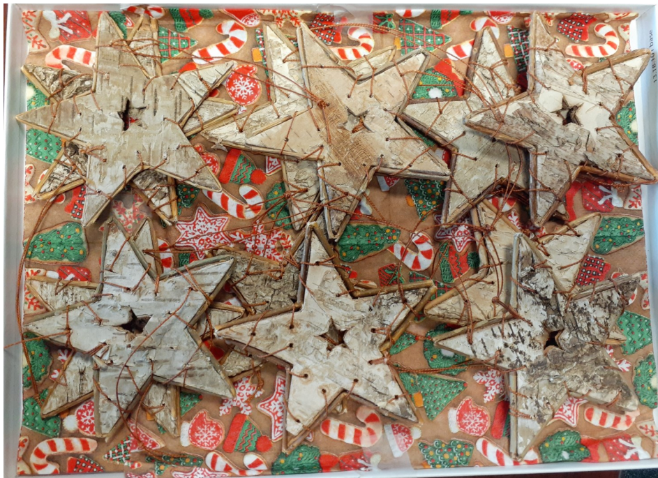
St. Oswald's hand-crafted stars