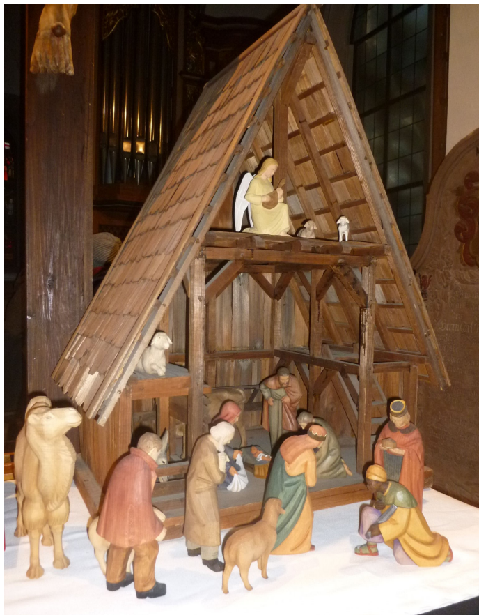
St. Oswald's nativity crèche