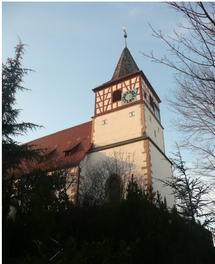
St. Oswald's Church, Weilimdorf