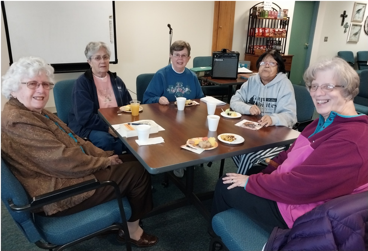
♥ Fellowship ♥