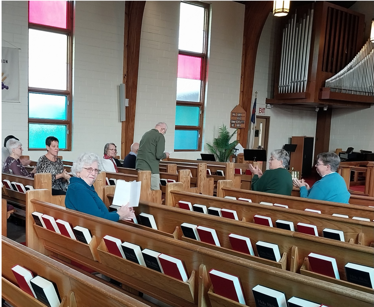
Recognizing our Vets on Sunday, November 12th in honor of Veterans Day.