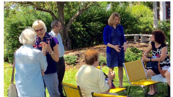
Above: Zion had refreshments in our Prayer Garden on July 2nd. We were blessed with a beautiful day after the storm the day before.