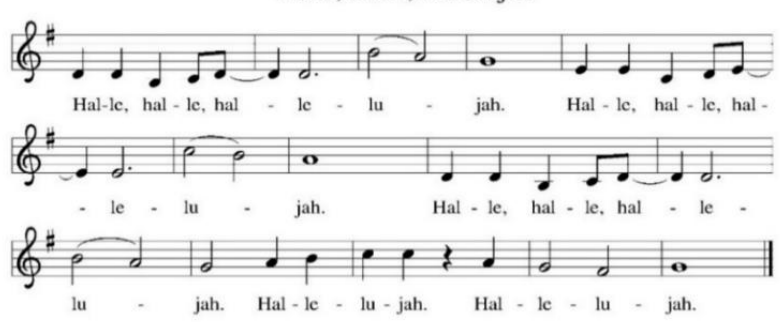
Gospel: Luke 17:2-6 Bible Pg. 1626

The holy gospel according to Luke. Glory to you, O Lord. The Gospel of the Lord. Praise to you, O Christ.