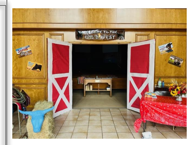
Enter.....into our 2023 VBS

Sunday PM: "Paul: Apostle or Impostor" Galatians 1:13 2:14