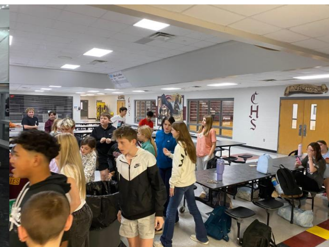
Junior High FCA