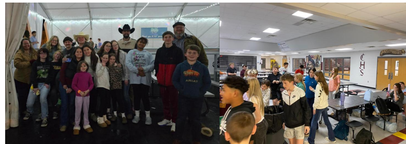
Area Wide Singing and Ice-Skating