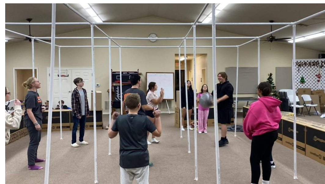
New Years Lock-In