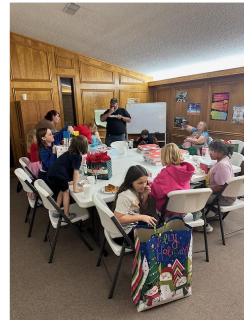
Little Tikes Secret Santa