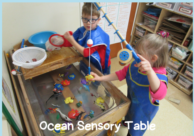
Ocean Sensory Table