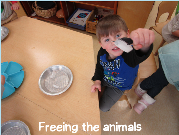
Freeing the animals