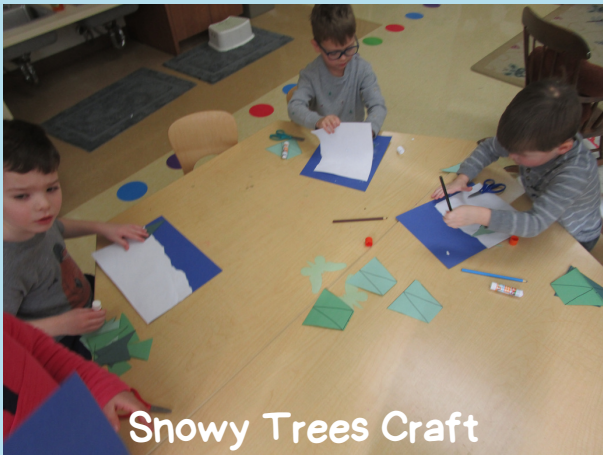
Snowy Trees Craft