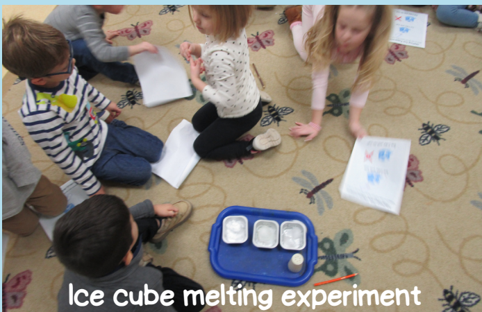
Ice cube melting experiment