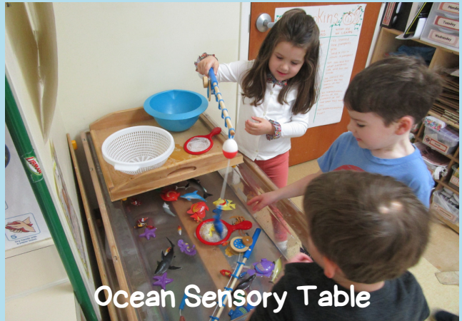
Ocean Sensory Table