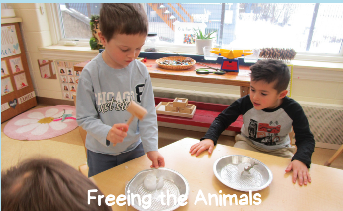
Freeing the Animals