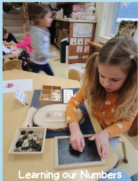
Learning our Numbers