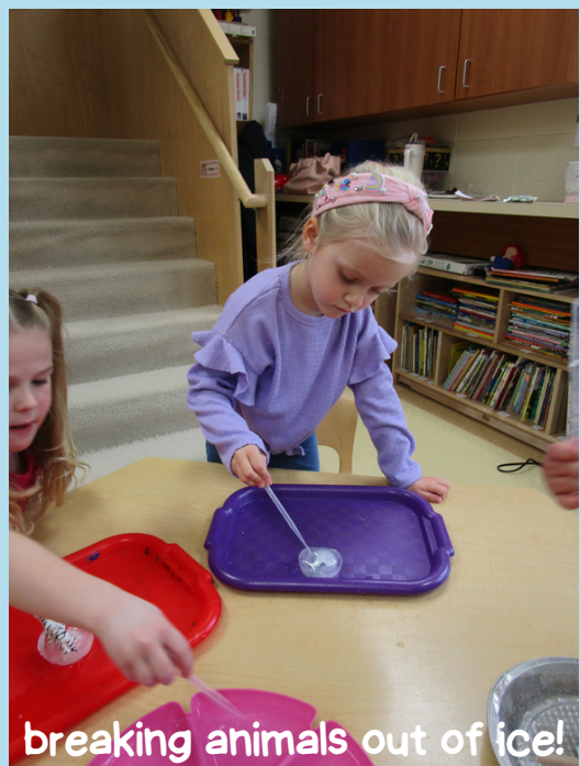
breaking animals out of ice!