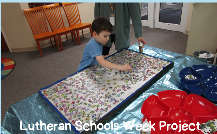
Lutheran Schools Week Project