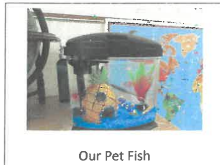
Our Pet Fish

The children enjoy using chalkboards to form letters. We are also using gems and old picture frames to reinforce our letters.