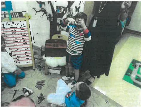
Mystery Mailbox! T is for Train and T-rex