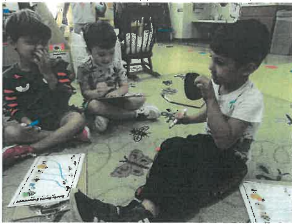
Smelly Socks Experiment