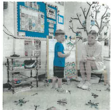
All About Me Sharing