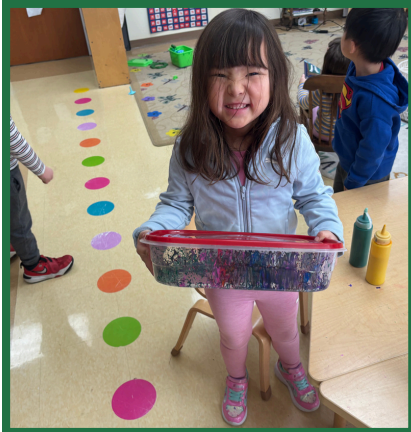
J is for Jumping Jelly Beans