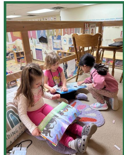
Library Dramatic Play