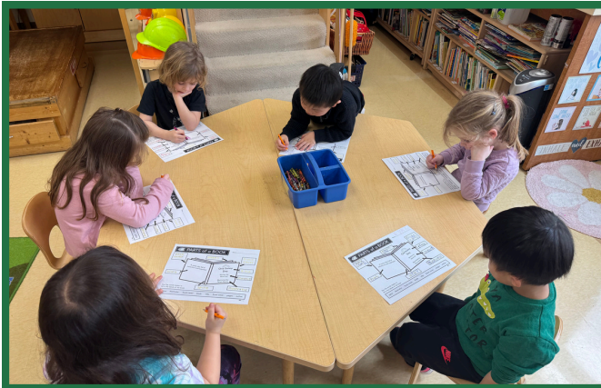
Labeling the Parts of a Book