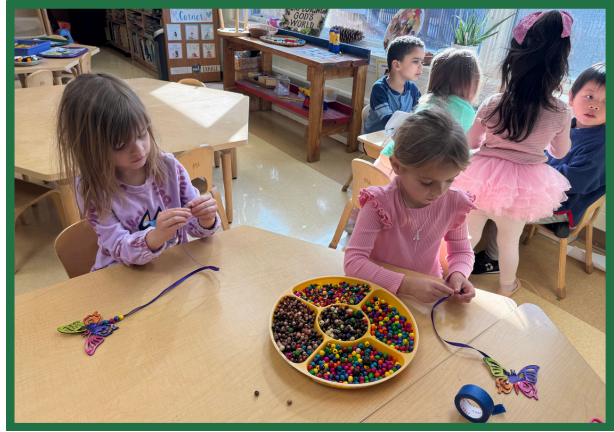
Our Art Show Projects