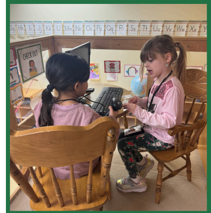
Library Dramatic Play