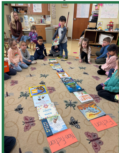
Sorting Fiction and Non-Fiction