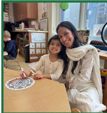
Learning About Holi