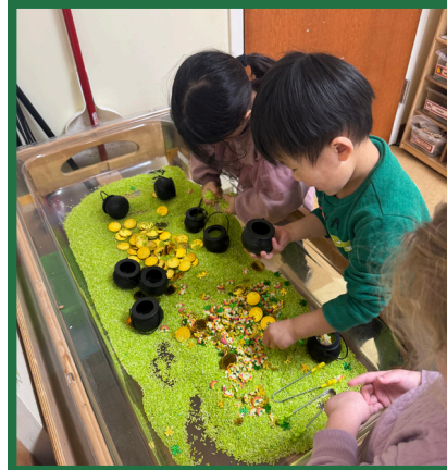
St. Patrick's Day Sensory Table