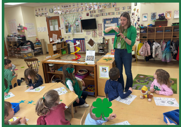
Gold Coin Experiment