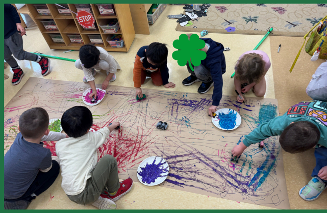
W is for Wheel Exploration